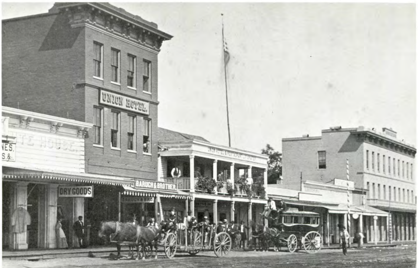
West Street - 1873