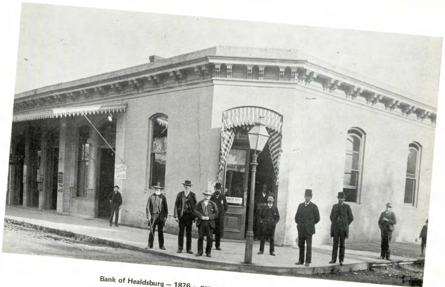
Bank of Healdsburg – 1876 – present site of Bank of America