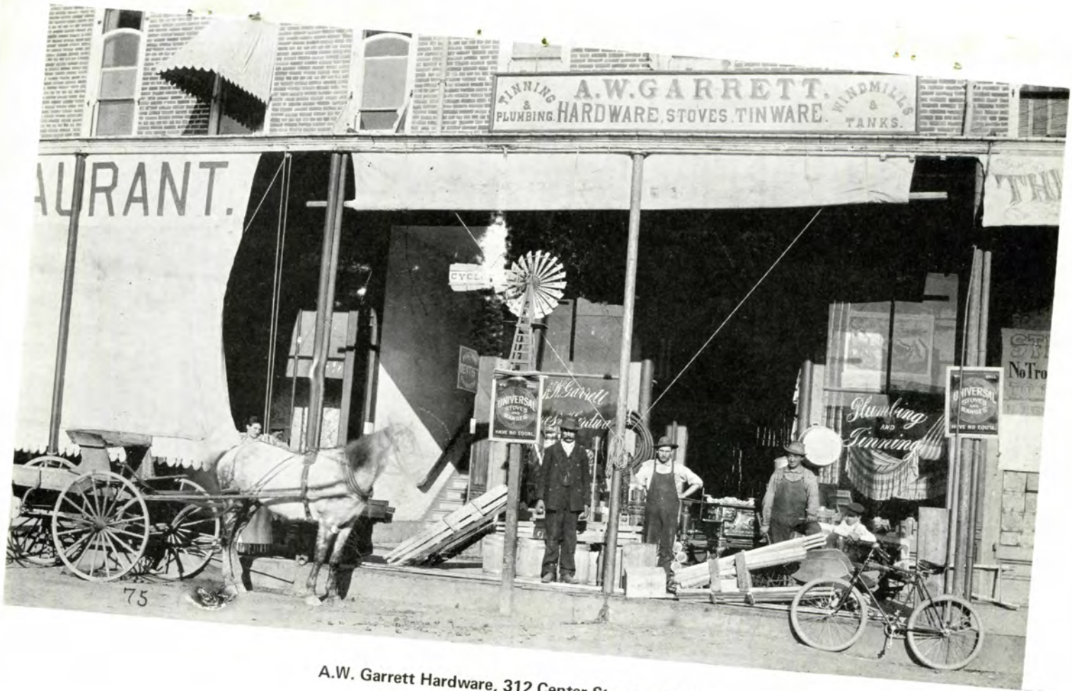
A.W. Garrett Hardware, 312 Center Street – 1893