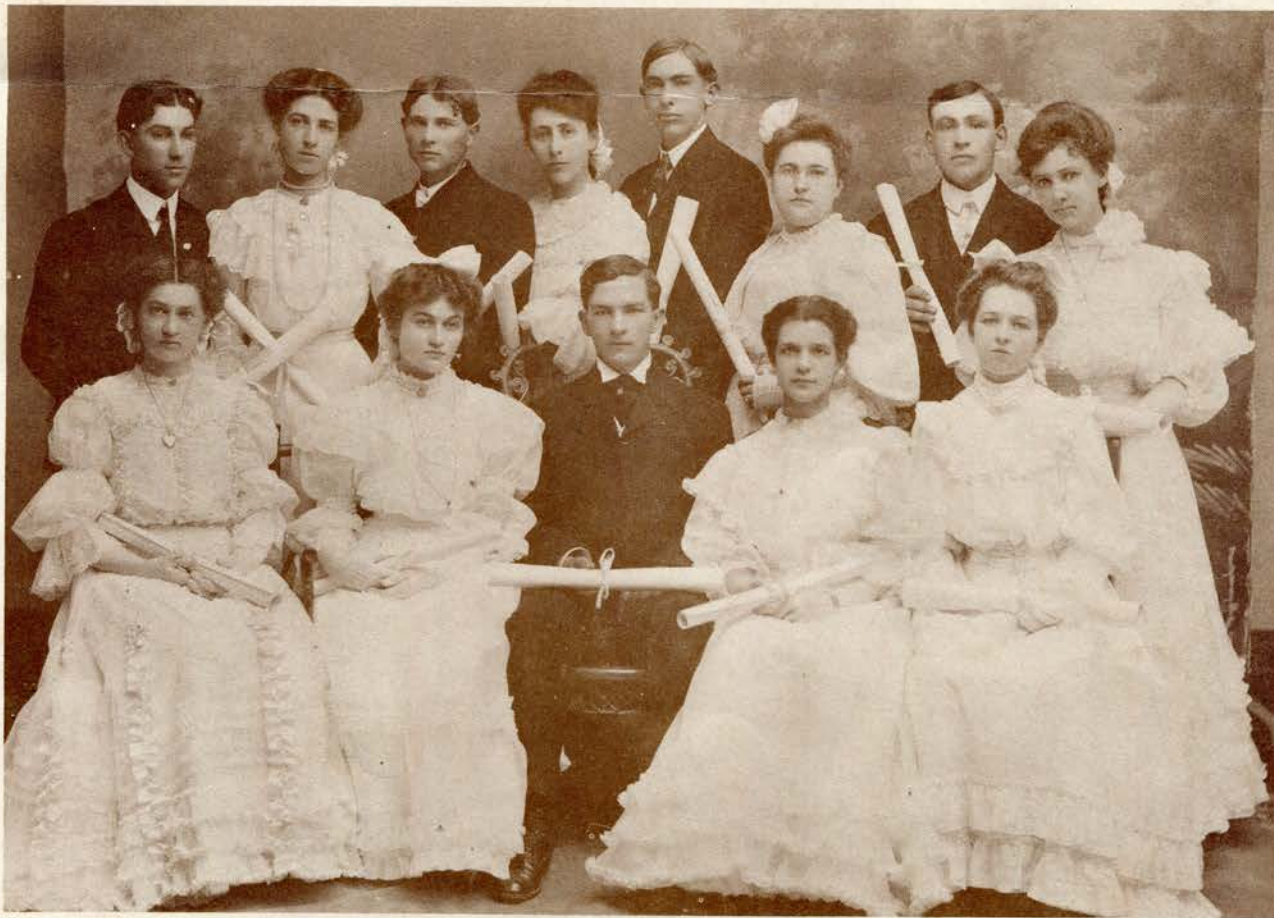
H.H.S. CLASS OF 1905

Published by HEALDSBURG HISTORICAL SOCIETY OCTOBER 1978