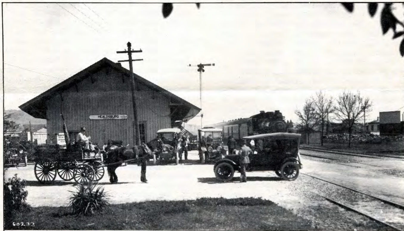
Healdsburg Depot, built in 1872, seen circa 1915. Northwestern Pacific train unidentified. (There was a locomotive built in 1883 at the Grant Iron Works named "Healdsburg". It was scrapped June 10, 1937.)

But under any name, or owner, northern Sonoma County now had a railroad. Some towns were not so lucky. The town of Bloomfield, which had long been promised a line, was left out of the system completely, even the narrow gauge system of western Sonoma County, and its industry thereby dwindled. In 1884 the southern end of the line that came to be known as the Northwestern Pacific was extended to Tiburon, and later to Sausalito. In 1889 the line was extended north to Ukiah, and by 1914, to Eureka.