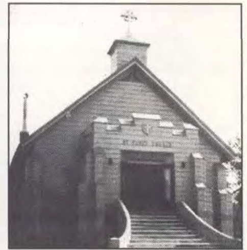
St. Paul's Church