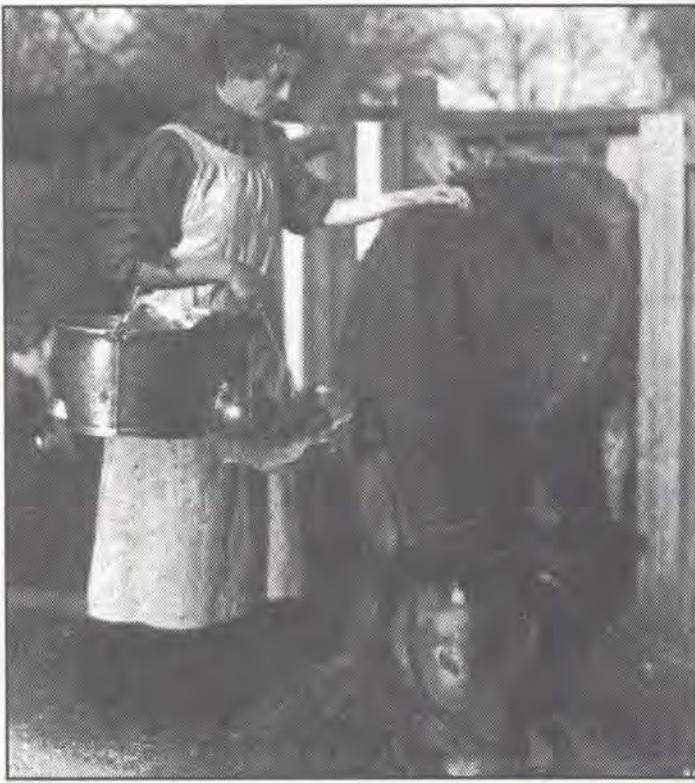
Unknown woman at "Milking Time", 1911