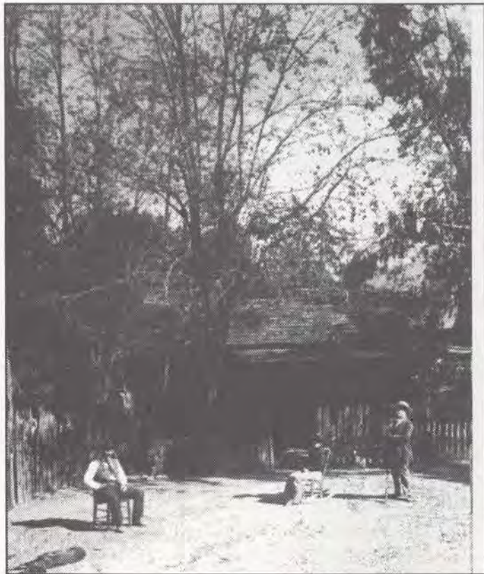
Typical early settler's cabin in Healdsburg area; Col. Tombs home near Skaggs Springs

tected themselves and their families, drove stock, drove wagons, tended to families and animals, and even continued alone if widowed.