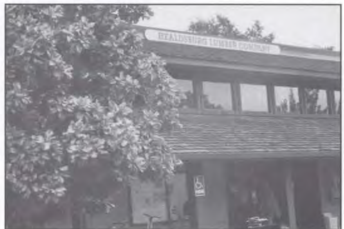
Present entrance to Healdsburg Lumber Company.