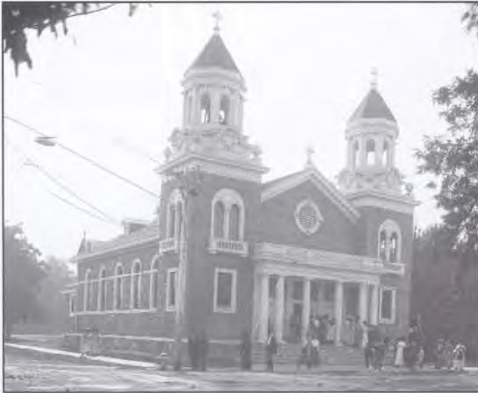
St. John's Catholic Church, circa 1912