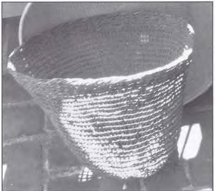
Photo of the common utilitarian carrying basket of larger weave.

A sampling of the Healdsburg Museum's fine collection is on display in the gallery.