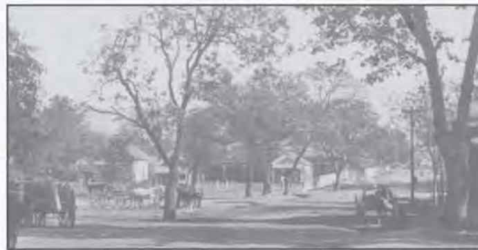
Top photo, Healdsburg Avenue, 1864; center photo, Adventist Home at the corner of College Street and Grant Street, circa 1882; bottom photo, the Healdsburg Plaza before it was fenced and with few remaining native trees in 1872, wagons used the Plaza as a parking lot.

("Worse than Chinese Lepers"), featuring a public drunken street brawl in North Healdsburg between a "Healdsburg hag" and a "visiting San Francisco virago."