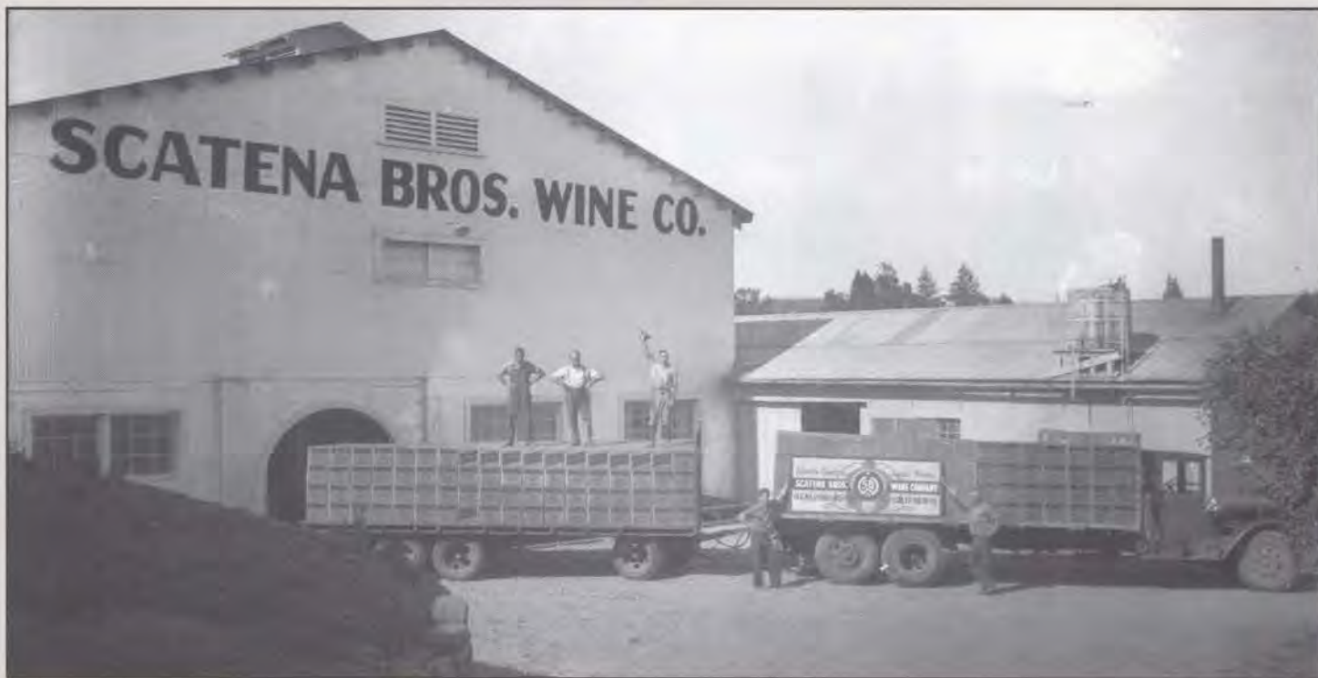
The Scatena Bros. Wine Co.