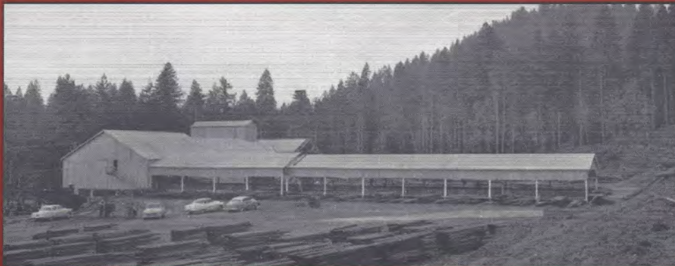
California Timber Products