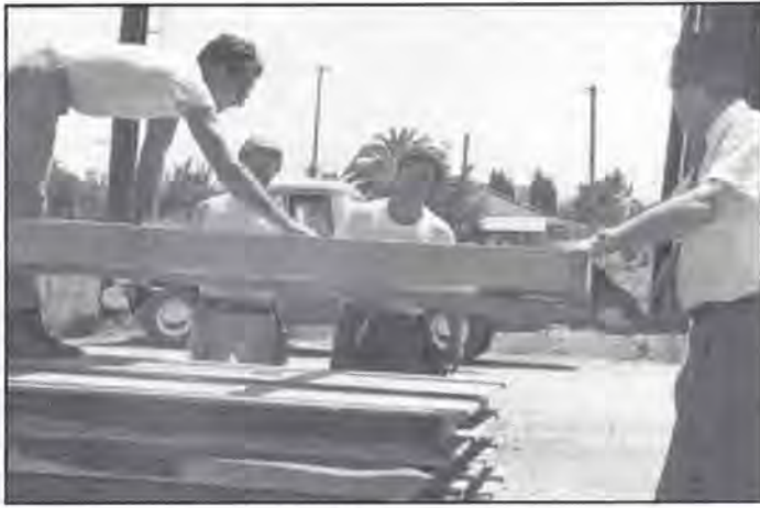
Isaco Lumber Company, 1964