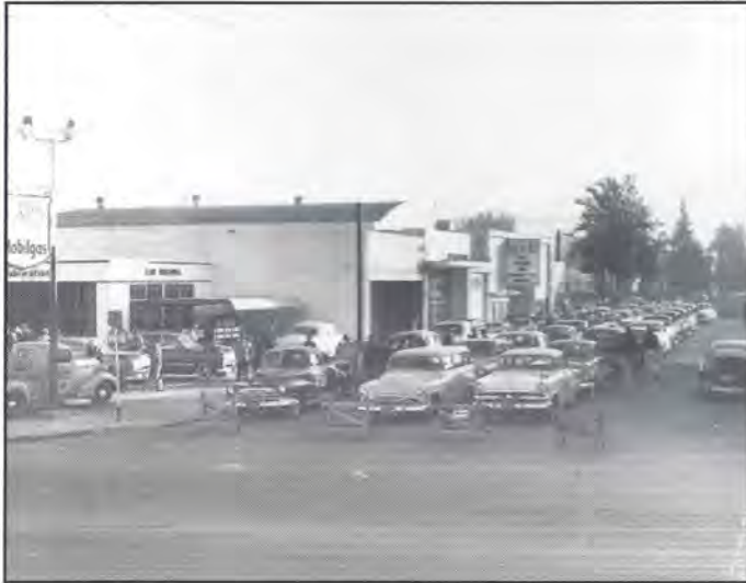
Aven Theater, circa 1957

You're old if you remember the inflatable slide at Brandt's picnic grounds on the Russian River. You're older if you remember the two-tiered diving board at the River. You're oldest if you remember the toboggan slide at Merryland Beach at the River.