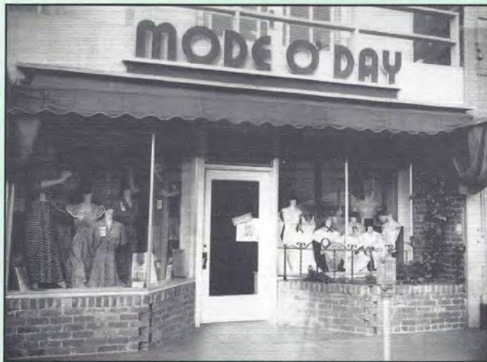
Mode O' Day Shoppe, 1952