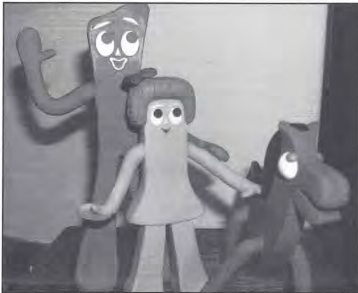
Gumby, Minga and Pokey in Museum display

These colorful plasticine figures were created by animator Art Clokey and used in his pioneering work in "claymation." The characters were brought to life using stop-motion clay animation, which is very exacting work. It takes 1,440 still-frame pictures to make one minute of clay animation.