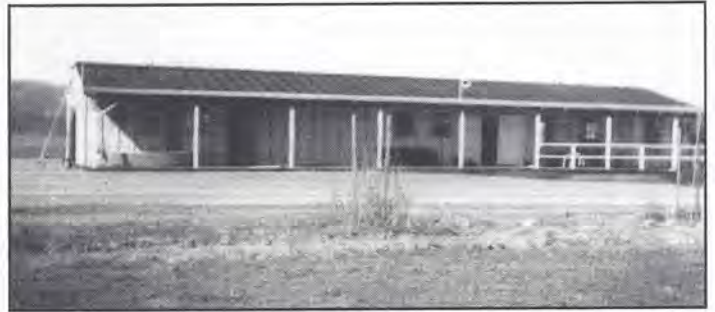
Russian River Riders Clubhouse opening, 1957

By the late 1980's and 90's the number of farming families declined in Sonoma County, and the character of RRR membership changed along with the demographics. Fewer horses lived in a pasture behind the house and more were boarded at stables. Owning a horse got to be an expensive proposition. Club membership declined and coping with maintaining ownership of the club property became a challenge. One bright spot was the Hoofbeats Pony Club founded in 1989. The Pony Club is part of the United States Pony Club organization.