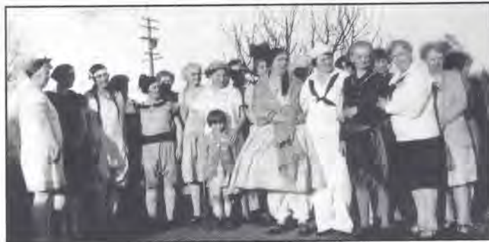
Costume party mid 1920's

of charitable donations that would fill a thick ledger, bits of humor among the generosity, and many examples of friendship.