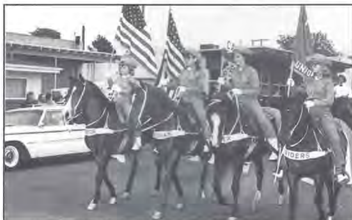
Junior Russian River Riders Mounted Color Guard at FFA Parade, 1965