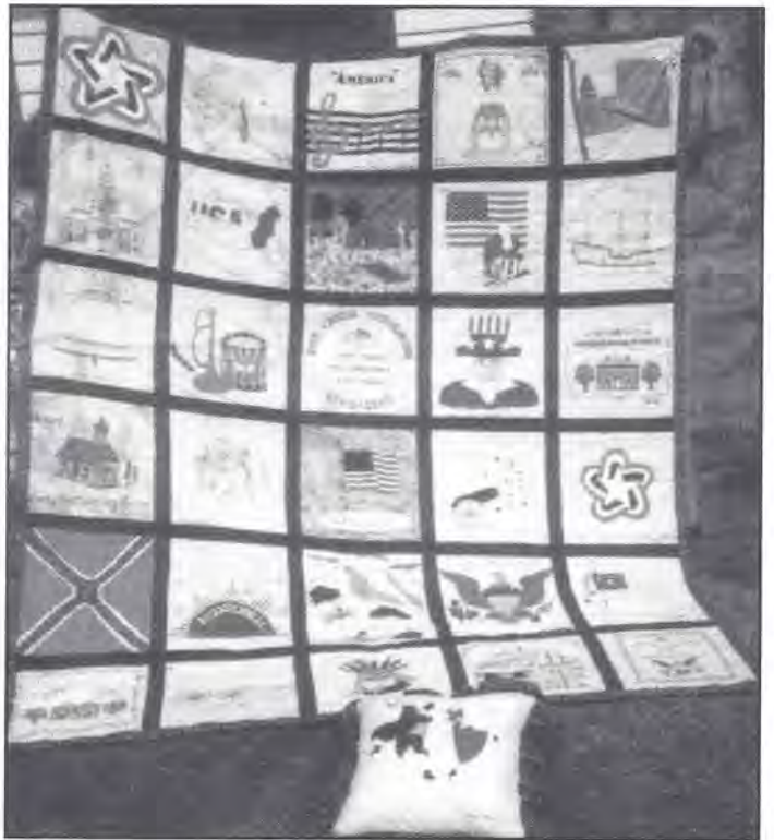
Quilt and pillow made in 1976 by club members in honor of the Bicentennial.

In 1975 a "Friendship Quilt" was made by the 35 members, each designing a square to "reflect the personality of its maker." In 1976, also in honor of the Bicentennial, a second quilt was made of squares designed by the members, and a pillow with embroidered names of all the members. This quilt won two blue ribbons, one each at the Sonoma District of the Federation of Women's Clubs, the other at the State Convention of the Federation. The two quilts and pillow were raffled off within the club to allow members to keep them within the club.