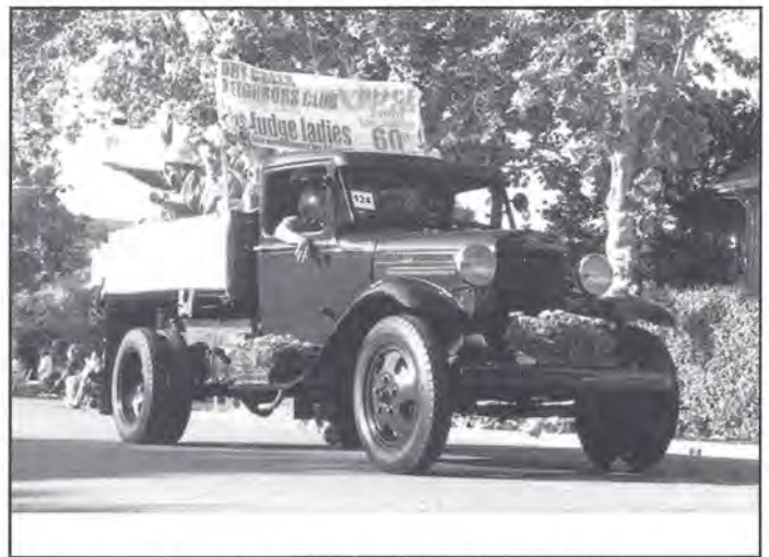
Dry Creek Neighbors' Club float in parade at the Healdsburg Future Farmers' Country Fair in May 2009

In May 2009 the club celebrated 60 years selling candy at the Healdsburg Future Farmers Country Fair and participated in the parade to celebrate the 100 th anniversary of club; the float received second prize in the club category.