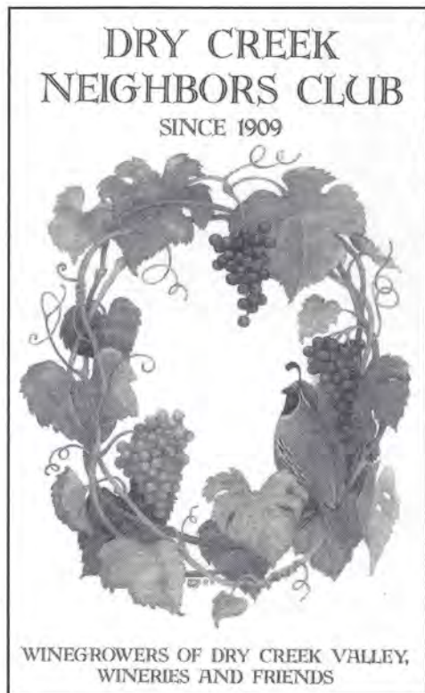
Cookbook published in 1995.