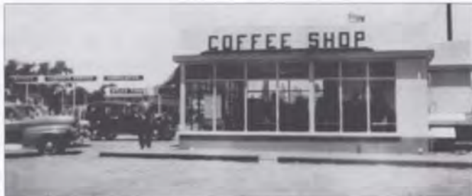
Wittke coffee shop, Healdsburg Ave.

located, just a block off the Plaza. These dehydrators ran 24 hours a day for most of the months of August and September. During those months we smelled like a prune town and occasionally worse. Back in the old days, real chicken fertilizer was applied to the orchards that were literally at our front door.