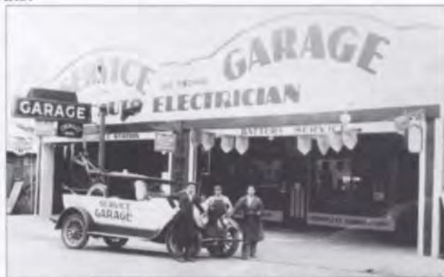
Frediani garage on Healdsburg Ave., 1920s

them in exchange for their cutting the lawn or turning over the soil for us to plant a vegetable garden. We grew our own vegetables and often went to the vegetable garden run by an Italian down by the train station. My father was an avid hunter of wild game and game birds; my grandparents had a large vegetable garden and chickens and eggs, rabbits and goats.