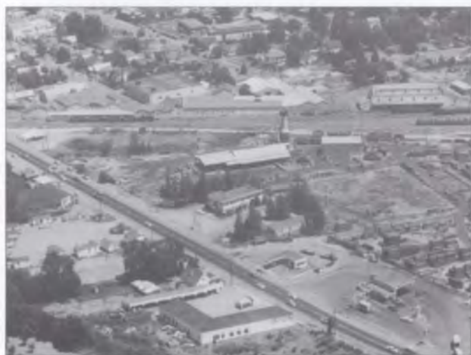
Healdsburg Avenue South End, 1950

Healdsburg was an industrial town. We had lumber, gravel and agriculture. There were several lumber yards in and near the city limits. Besides the ones that are still here, there was Hammond Lumber at the site now occupied by the Exchange Bank and a large portion of Safeway's parking lot. There were two mills up Mill Creek, one just north of Simi Winery and another near Lytton Springs Road. Each one of these mills had a cone burner. Some of the burners were very small and some were very large and they almost always had a fire going in them to eliminate the considerable amount of sawdust and scrap wood that the mills were generating. There was always smoke in the air that mingled with the aroma of fresh cut Douglas fir. We smelled like a lumber town.