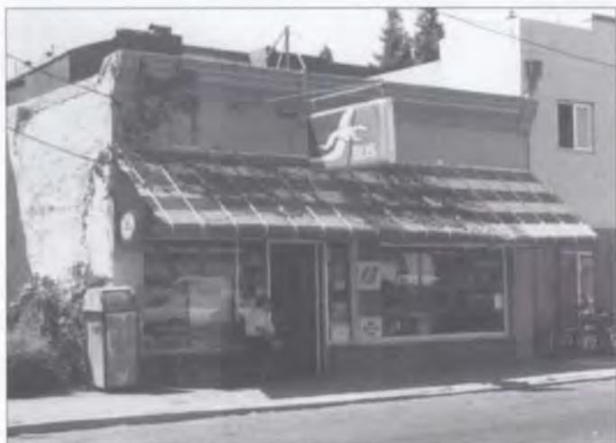
Greyhound Bus Station, Center St.

I've mentioned Healdsburg Avenue. It wasn't always Healdsburg Avenue. Until the early sixties it was the Redwood Highway, the U.S. 101. Before the freeway was built, it took half an hour to get to Santa Rosa from here. On holiday weekends, traffic could be backed up for miles in either direction of Healdsburg. A lot of cars and trucks passed through Healdsburg in those days. There was a truck stop where McDonalds now stands. There was a truck repair shop and a trucking company next door. There was a Studebaker and Chevrolet dealership within a block of the Plaza.