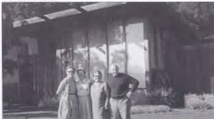
McDonough Heights home, 1965

My parents' house took over two years to build as, while it looks very simple, it is very complex. All the walls, both inside and out, are virgin redwood. The electric Skill saw was introduced at that time; it revolutionized building and made the work easier and faster than with the hand saw. The inside of the house has mostly built-in redwood cabinetry for storage, with a minimum of furniture besides sofas, chairs, tables and beds. The house is quite Japanese in feeling and I was able to have the shoji panels which divide the rooms made in Japan. At the time, my parents were in their early 50s and they both loved the contemporary look. My mother gave away all her possessions, including china and crystal, and replaced them with Danish furniture and modern china and crystal.