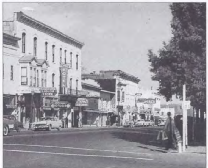
Downtown Healdsburg, 1950s

I was born here fifty years ago. Some of you have lived here longer than me but many of you haven't. I don't feel old but my age does put me into the category of an old timer, at least here in Healdsburg. We've all seen a lot of change in the last couple of years. Read the local newspaper and you'll find that some people don't like that change. They whine about the items of clothing they feel they can no longer purchase here or who is going to build what and where. In the next few minutes I would like to briefly describe to you the town I grew up in to give you an idea of how it has changed in the last fifty years. I want to try to give you a feel for the old town. It may sound as though I am bashing the old town of Healdsburg but that isn't the case. I feel that I am very lucky to have seen this town in the middle of the last century, but I am also happy that it is the