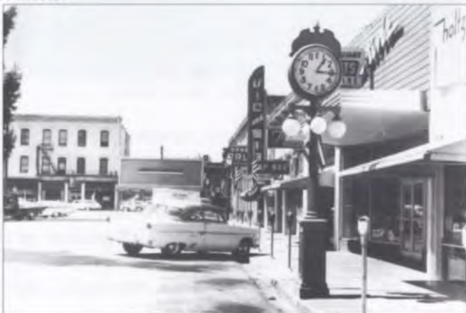
Plaza Street, 1960

There was a bar in the Plaza Hotel and another across the street from the train depot. There was one where Circle K now stands and another where Fitch Mountain Eddie's is located on what used to be called Nard's Corner. There was another one just north of Simi Winery across from the lumber yard and another down by the river. Healdsburg was a town with many bars. These bars occasionally attracted a rough crowd. It was not uncommon for the Hells Angels to roar into town and spend the day and night at the local bars. There would be motorcycles lined up on both sides of Healdsburg Avenue from North Street to nearly the train tracks. I guess you could say that they were some of our first tourists.