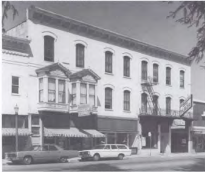
Plaza Hotel, 1967

Healdsburg Bar and Grill is now, John and Zeke's where it still is, a bar where the Brandt Insurance office is and another one at the opposite corner of the block near Center Street.