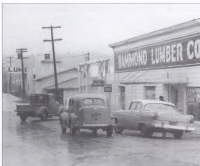
Hammond Lumber Mill, 1955

Healdsburg was an industrial town. We had lumber, gravel and agriculture. There were several lumber yards in and near the city limits. Besides the ones that are still here, there was Hammond Lumber at the site now occupied by the Exchange Bank and a large portion of Safeway's parking lot. There were two mills up Mill Creek, one just north of Simi Winery and another near Lytton Springs Road. Each one of these mills had a cone burner. Some of the burners were very small and some were very large and they almost always had a fire going in them to eliminate the considerable amount of sawdust and scrap wood that the mills were generating. There was always smoke in the air that mingled with the aroma of fresh cut Douglas fir. We smelled like a lumber town.