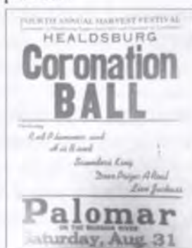
Palomar Publicity Poster