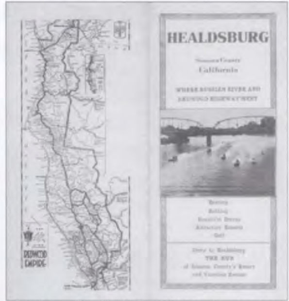
Pamphlet promoting Healdsburg "Where Russian River and Redwood Highway Meet," 1960s

Anyone who longs for the old Healdsburg doesn't really remember the old Healdsburg. We have a lot to be thankful for. When the freeway bypassed us we didn't wither. We grew and we adapted. We still have our heavy industry. We have a downtown Plaza surrounded by a wide variety of shops, that most other cities in this county are envious of. We have beautiful B & Bs. We have a Chamber of Commerce that operates in the black. We have a solid tax base because of the diversity within our business community. We don't have major traffic problems. Our electricity stays on when others are suffering blackouts. We have good schools. We have a wide variety of fine restaurants. Healdsburg's borders touch three world class viticulture appellations and we are within walking distance of a fourth. We are surrounded by wineries with world wide recognition that draw people to our community year round versus the days of the one weekend prune blossom tour. We can still buy most everything here that we have when I was born here, underwear included, and for the items that we can't buy here, we are only fifteen minutes away from major shopping malls. In my opinion, if we could make just one more change we would live in the perfect community. If we could find a way to make housing affordable in this community, our children will be able to work and live here and the Healdsburg native will not become an endangered species in our town.