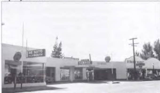
Remodeled garage buildings and Redwood Market

I returned to Healdsburg in 1955 and joined my father in his automobile business. I thought that the least I could do--as the only child and because my parents paid for my four years at Stanford--was to help my father.