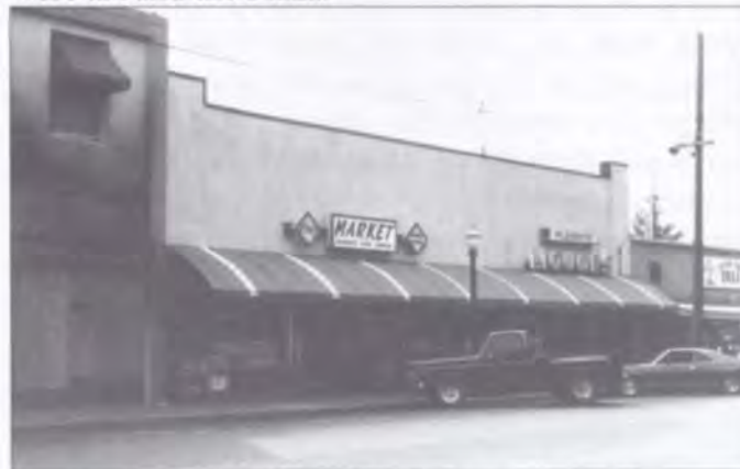
Plaza Market and liquor store, Center St.

Other than one bar, the entire downtown Plaza area has changed. J. C. Penney's was on the corner where Kajul now stands. There was a theater, a Sprouse-Reitz, the Plaza Hotel and a feed store among others on the west side of the 101. All of the businesses moved or ceased to exist when the entire block was torn down. Anyone who can remember traveling down the back alley behind these stores will tell you they were a fire waiting to happen. Ben Franklin, Gromo Market, and the Bank of America were on the east side of the 101. Garrett Hardware, Schwab Shoes, Western Auto and Anderson Jewelers were around the Plaza.