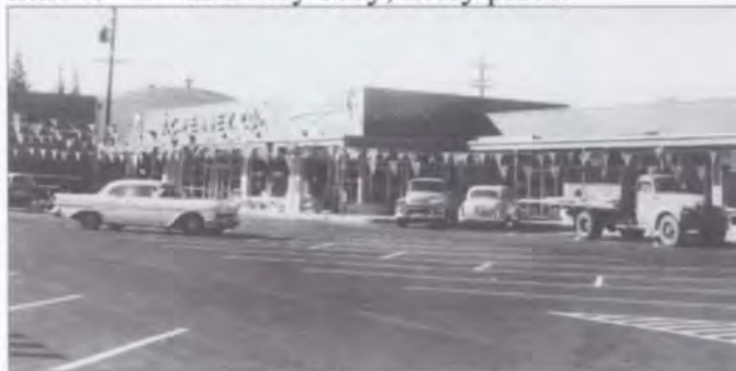
J. C. Penney Co., 1965

known as Healdsburg Avenue in the center of our little town was a very busy, noisy place.