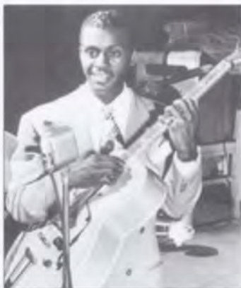
Saunders King, 1940

They had this wonderful orchestra from San Francisco that started coming up - Saunders King. He was just great! People came from all over just to dance there.