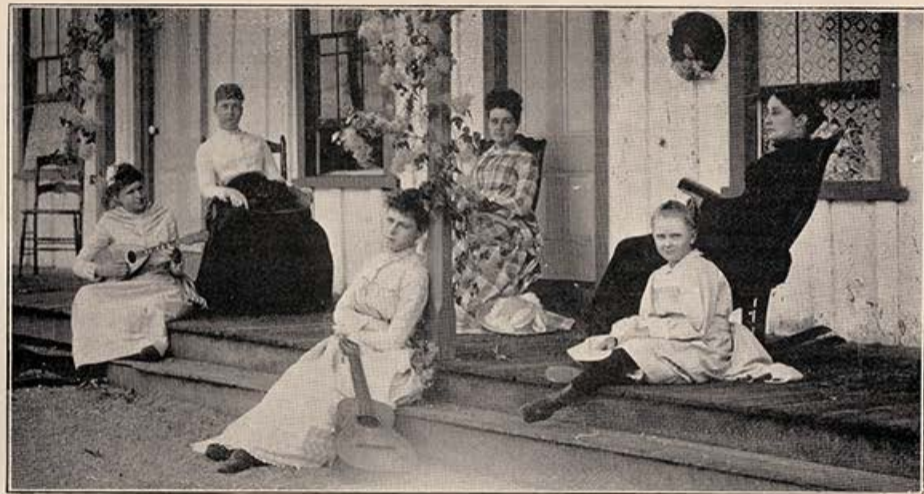
SKAGGS HOT SPRINGS