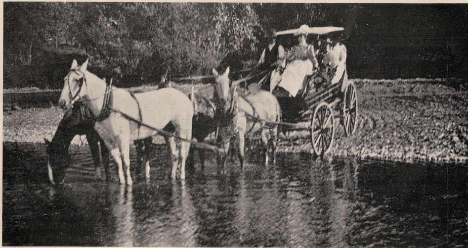
ON THE ROAD TO THE FRENCHMAN'S