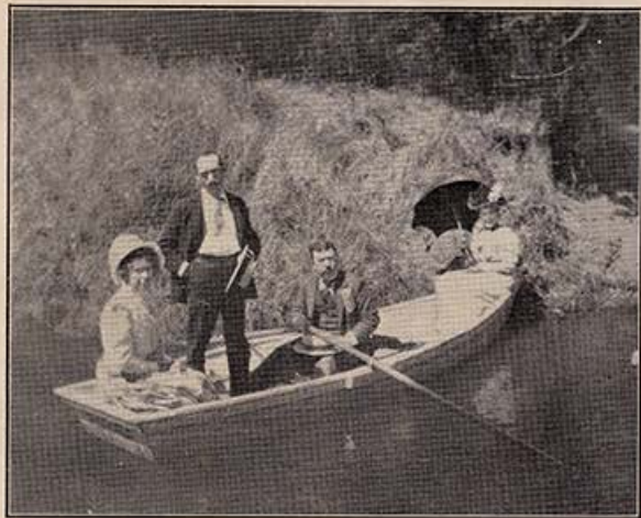
ON THE LAKE