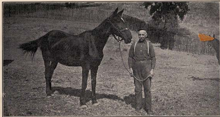
POSING FOR HER PICTURE

It will be observed that long, tiresome, dusty, and often dangerous stage rides are obviated. Within four and a half hours after leaving San Francisco you are landed at the Springs, with but nine miles of staging, which, by the way, you will pronounce the most delightful part of the journey. If there is a pretty bit of stage road on the Coast, it is from Geyserville up the Russian River Valley, thence westerly over rolling hills and through Nature's groves to the Dry Creek Valley (a veritable beauty spot of earth), thence up the valley northwesterly to Warm Springs Cañon, and thence through the cañon to the Springs. One of the most pleasurable features of a trip to the Springs is, in fact, the stage ride.