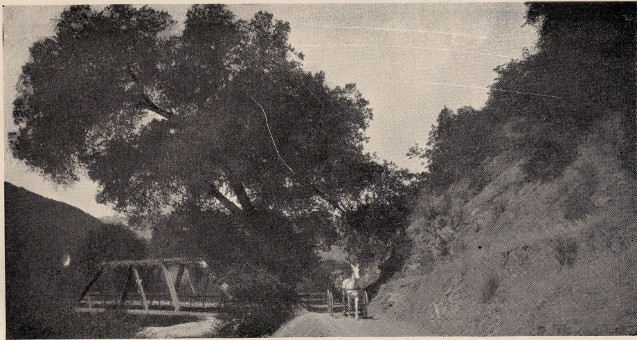
SKAGGS HOT SPRINGS—A DRIVE

alterative and laxative properties. The volume of water flowing from the Springs is at the rate of thirty gallons per minute, at a temperature of 125 degrees Fahrenheit, is as clear as a crystal, and, being accompanied by copious bubbles of gas, has the appearance of boiling water. In taste the water is pleasantly pungent from the presence of carbonic acid gas.