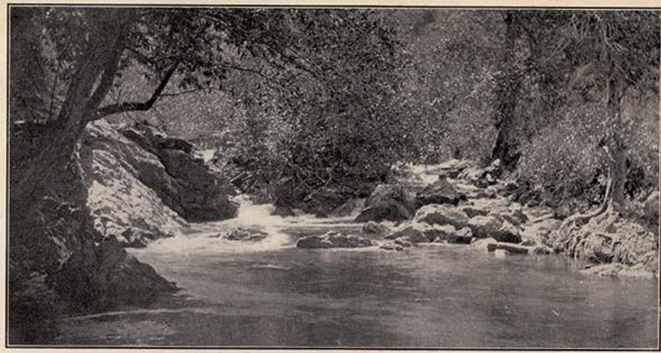
TROUT STREAM—SKAGGS HOT SPRINGS