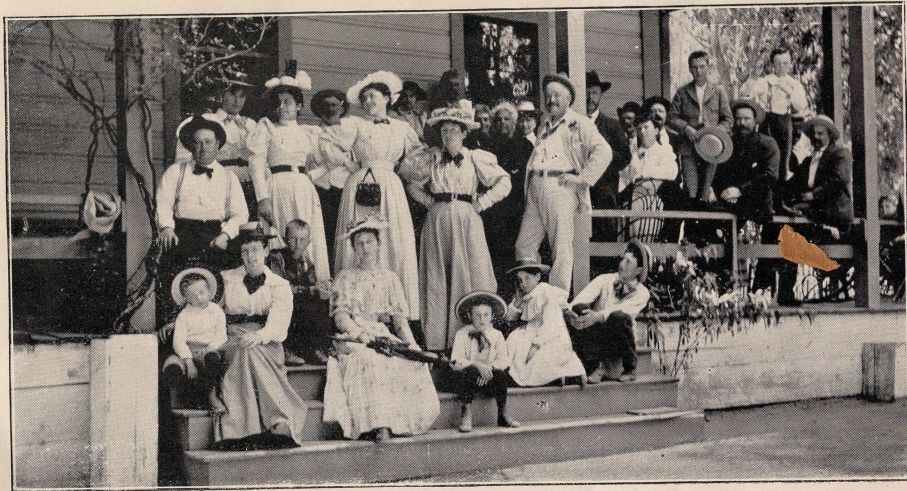
SKAGGS HOT SPRINGS

In estimating the expense of an outing, consider the cheapness of a round-trip ticket to Skaggs—the saving in fare goes a long way in paying a week's board.