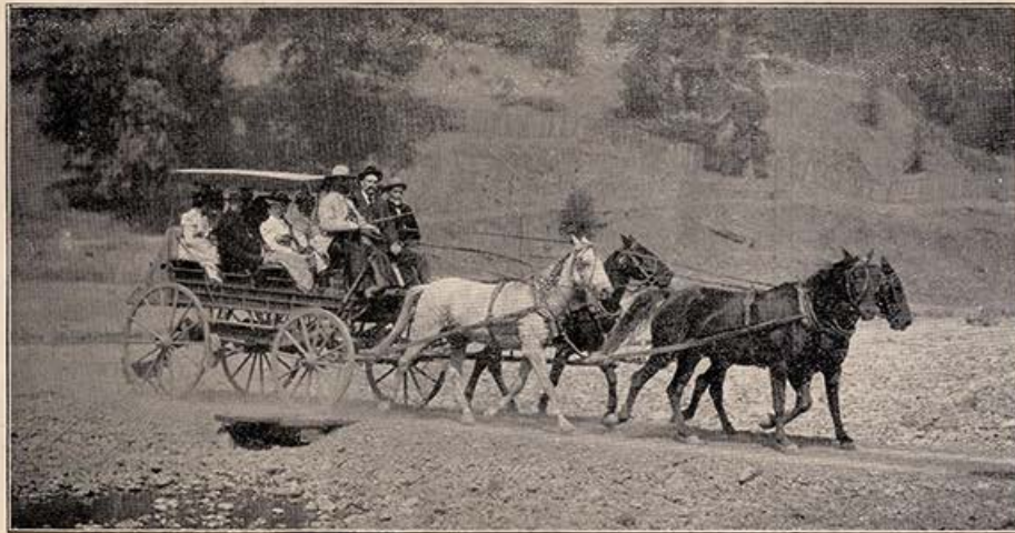
ON THE ROAD TO SKAGGS HOT SPRINGS