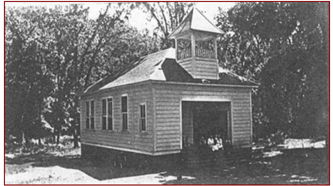
The original Canyon School built in 1913

The previous owner had made the old school house into four rooms. Ranae and her husband Bruce opened up the room once again like the original school room with high ceiling to create their kitchen, dining area and living room with fireplace. They joined a separate building in back of the school by creating a hall way to two bedrooms and a bath.