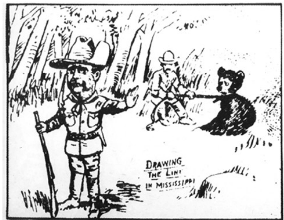
1902 Teddy Roosevelt cartoon