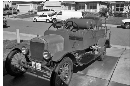
1919 Model TT Ford