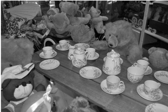
Teddy bears enjoying tea