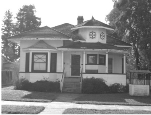
1901 George Ferguson Home, Queen Anne