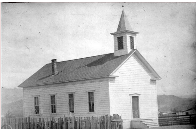
Christian Church (Disciples of Christ) - 1884

On November 8, 2009, the Geyserville Christian Church celebrated its 125 th anniversary. The original