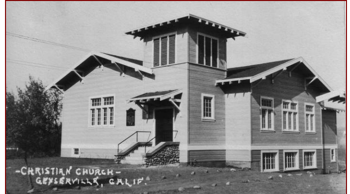
Christian Church built on same location - 1920

church was organized as the Disciples of Christ on October 18 or 19, 1884, by thirty individuals who felt the need for a community church on which to build a foundation of faith. The building was soon erected and a porch later added on the west entrance. In 1920 a new church building was constructed on the same site north of town center, and in 1921 the parsonage was built next door.