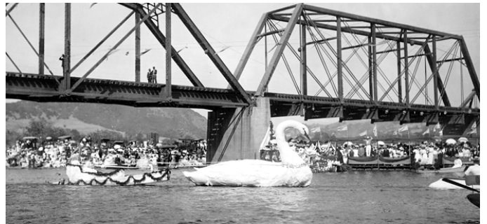
Water Carnival, 1909

This exhibit will feature early 1900s Healdsburg Water Carnivals, Fitch Mountain Resorts on the Russian River, Boating and other water fun. We will have an opening reception with wine and refreshments at the Museum. We will also present the awards to the winning student essay writers of the Museum's annual "Family History Essay Challenge." Please join us.