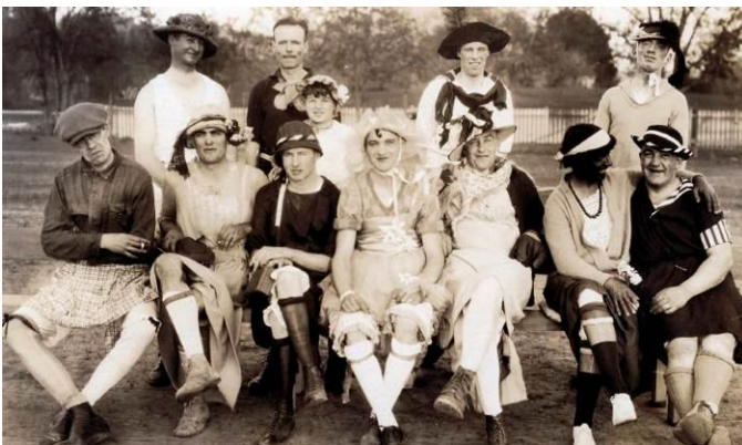
Corrick's Comics Baseball Team, 1924

The "Day of the Dead" exhibit will be on display November 2 nd to 9 th . A