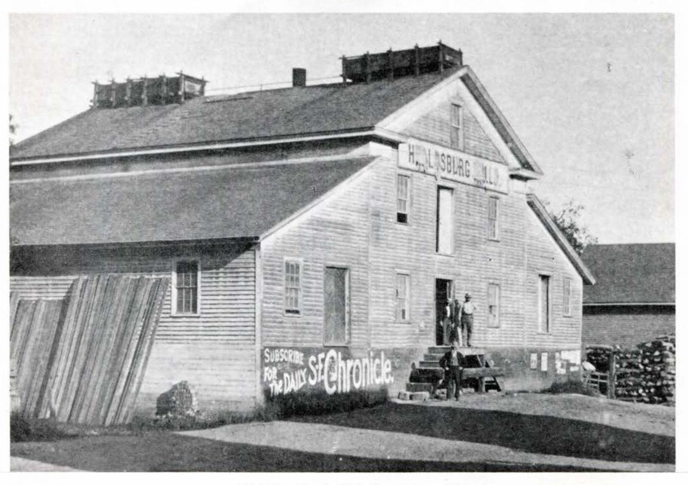
Healdsburg Flouring Mills, Hassett Bros. - 1873