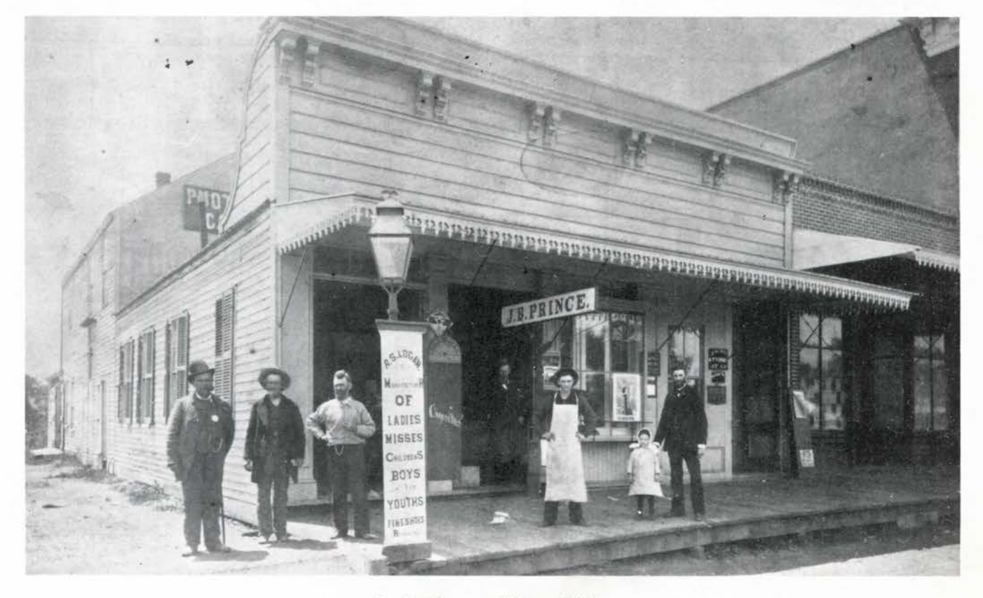
Healdsburg Public Library, 1904 Upstairs, Old City Hall