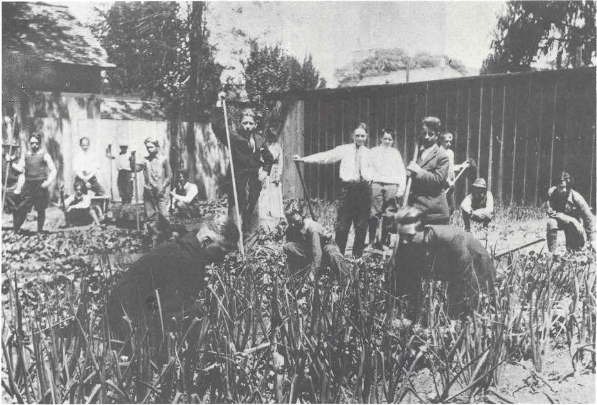
Victory Garden at Healdsburg Grammar School WWI (1918)