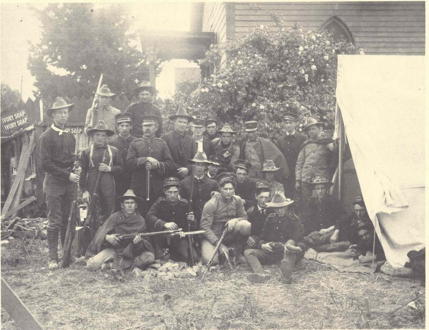
National Guard Encampment at Healdsburg Circa 1900