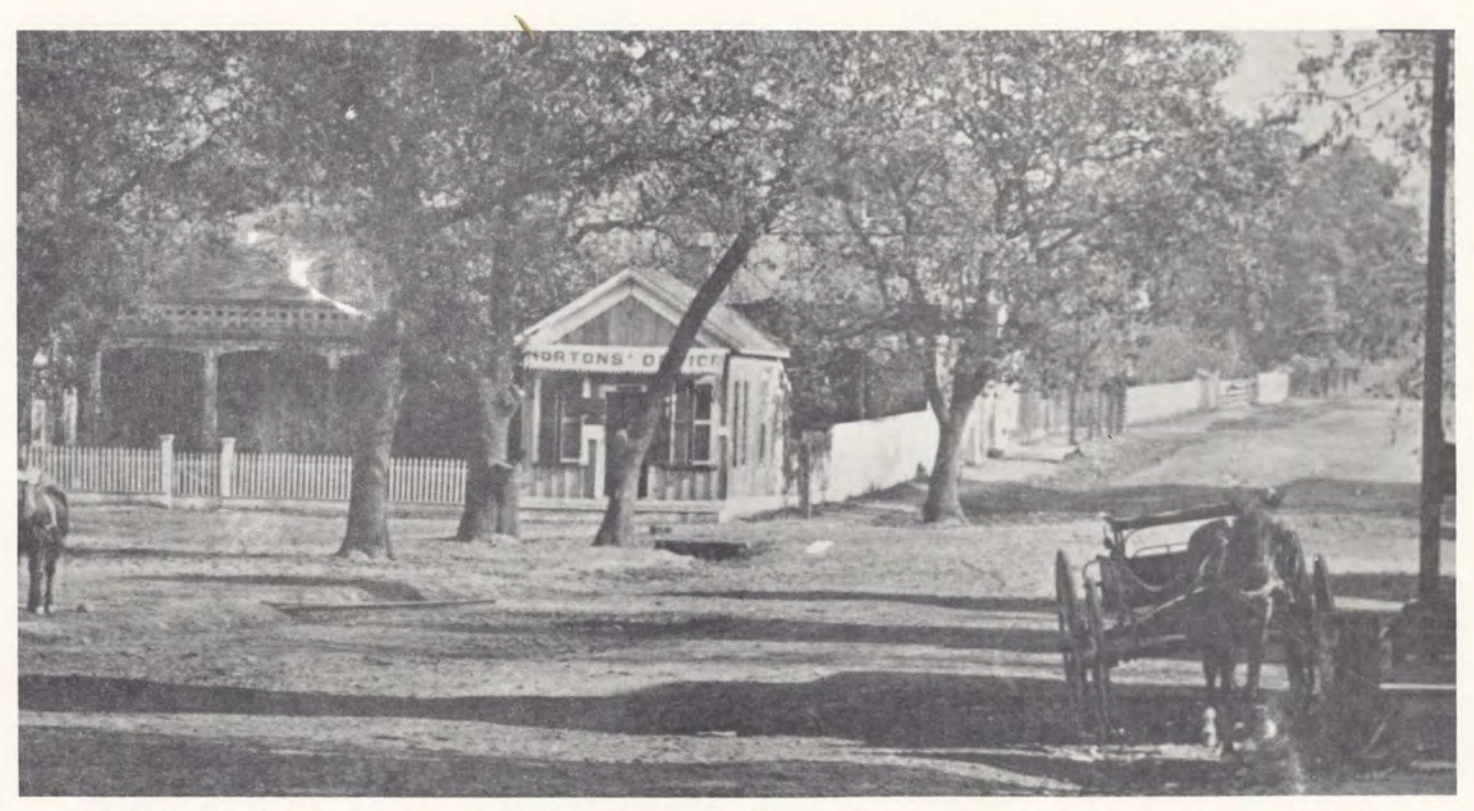
"Norton's Office" in 1872, northeast corner of Matheson and Center Streets. This was the site of the first Healdsburg City Council meeting March 5, 1867.