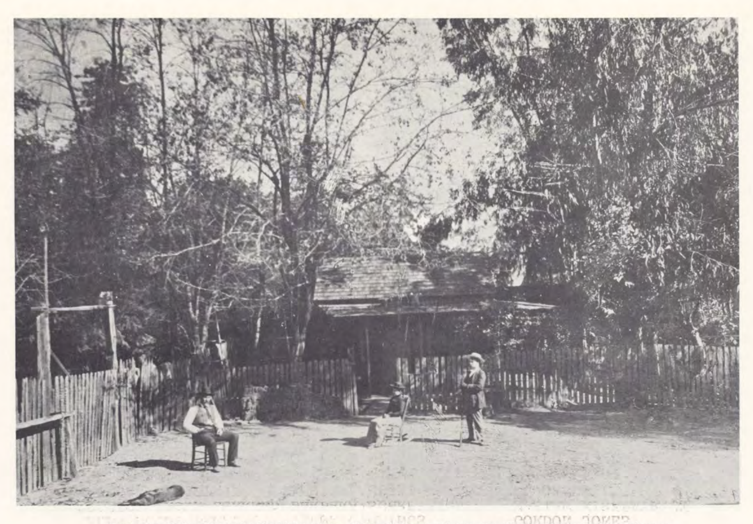
Typical settler's cabin in the Healdsburg area - Colonel Tombs at home near Skaggs Springs - date unknown.