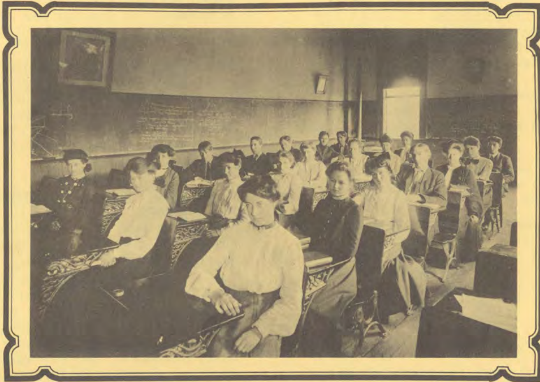
HEALDSBURG HIGH SCHOOL CLASS CIRCA 1910 IN OLD HEALDSBURG COLLEGE BUILDING AT FITCH & GRANT STS.