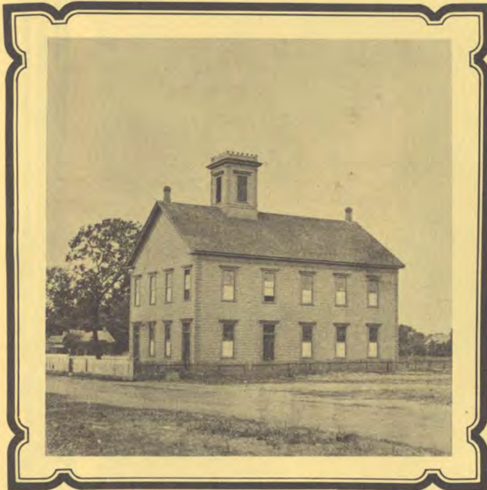
HEALDSBURG PUBLIC SCHOOL TUCKER ST. BETWEEN FITCH & EAST 1872