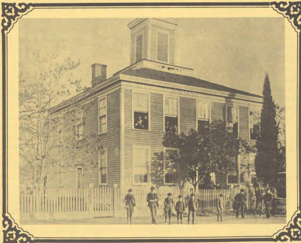
RUSSIAN RIVER INSTITUTE (ALEXANDER ACADEMY) AND STUDENTS - EAST SIDE OF UNIVERSITY ST. BTWN. TUCKER AND HAYDEN STS. - CIRCA 1875.