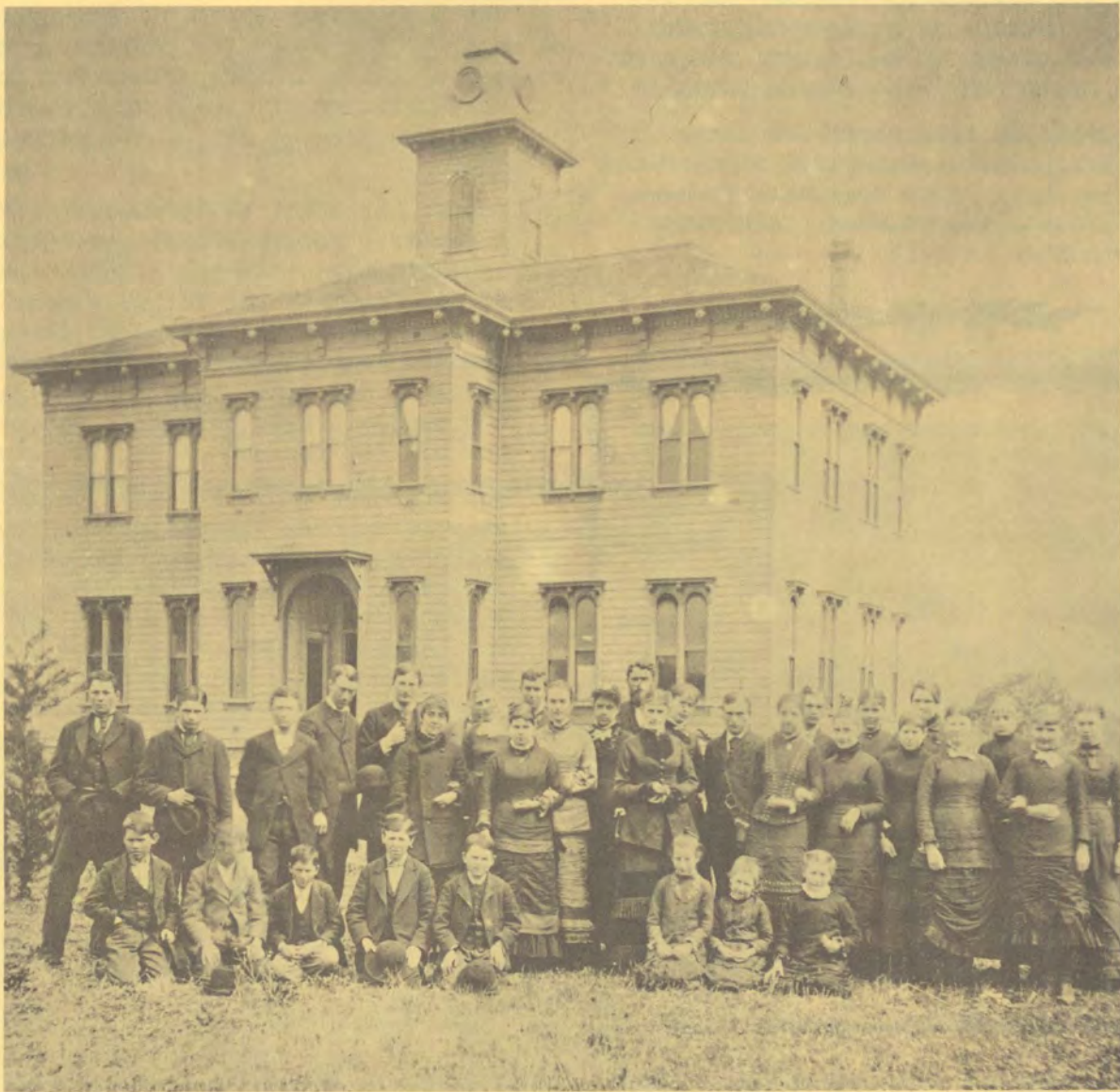
STUDENT BODY OF THE HEALDSBURG INSTITUTE 1879

PUBLISHED BY HEALDSBURG HISTORICAL SOCIETY ISSUE 23 - APRIL 1982