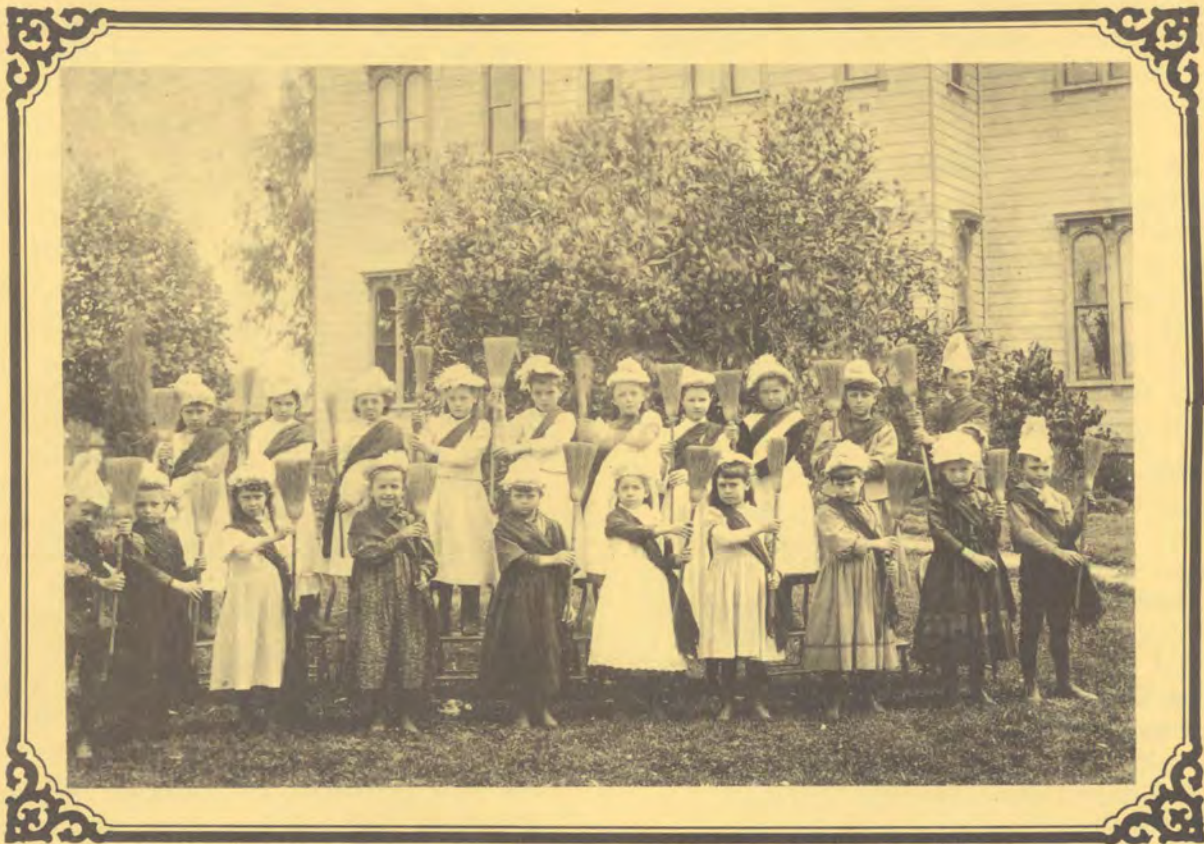
THIRD GRADERS WITH HAND-MADE BROOMS CIRCA 1890 AT ADVENTIST-RUN HEALDSBURG COLLEGE, FITCH & PLAZA STS.