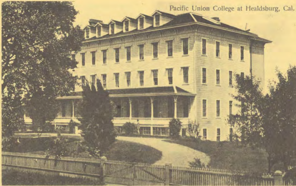
Pacific Union College at Healdsburg, Cal.