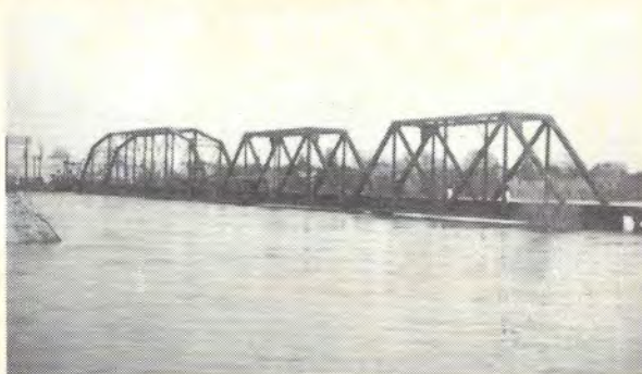
• The railroad bridge December, 1937 •

Most of the people watching from the Ark were standing on the porch, on the river side. No one thought of the maximum weight or the number of people the building and its underpinnings were supporting. Fortunately, the structure stood firm.