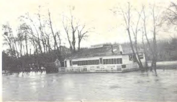
• The Ark during December, 1937 flood •