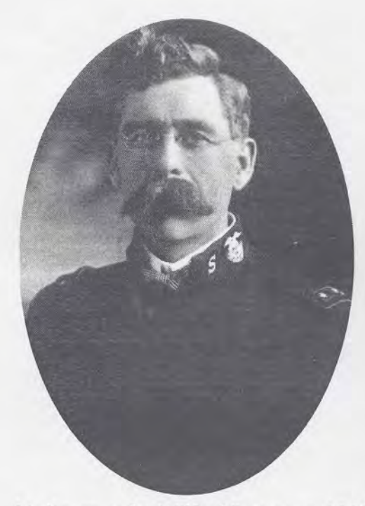
Lt. Commander Wilfred Bourne, c. 1910