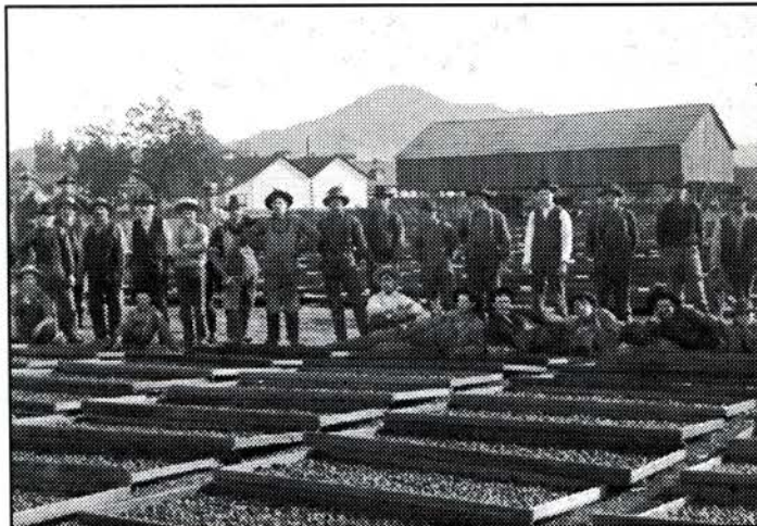
Drying prunes in the sun

In the spring the blossoms formed and burst out, covering the Healdsburg area in a blanket of white. The blossoms lasted for about a week and fell off, while the fruit then began to grow. By late summer the fruit had usually reached the desired sugar content, and was ready to harvest.