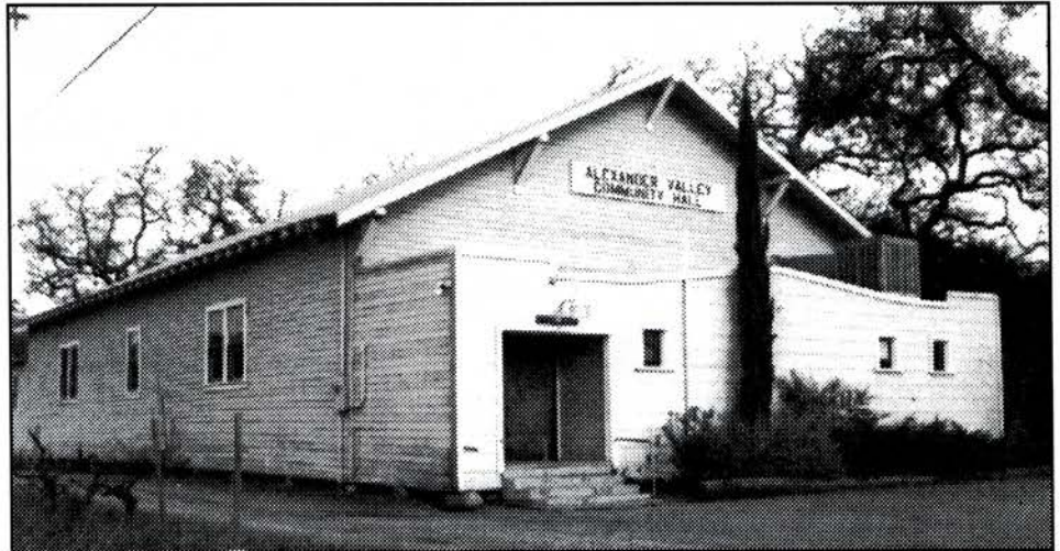
Alexander Valley Community Hall

The Alexander Valley Community has cared for and enjoyed these two historic structures for many years. May they continue to be the focal points of the valley for many more years to come.