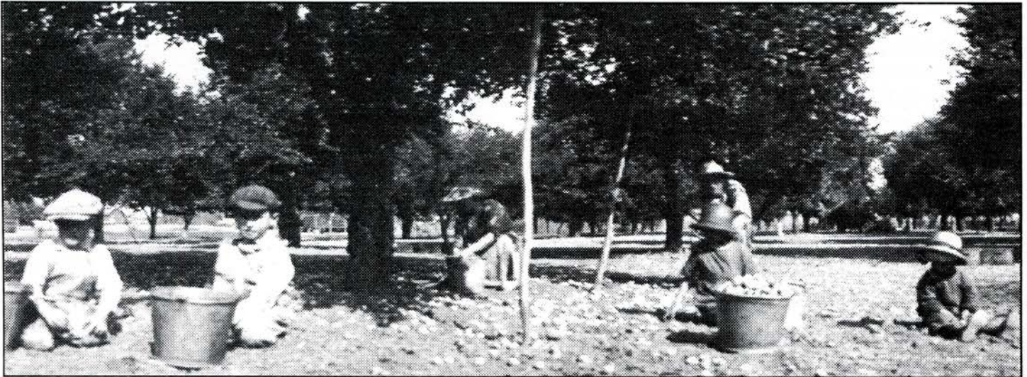
Picking Prunes circa 1919