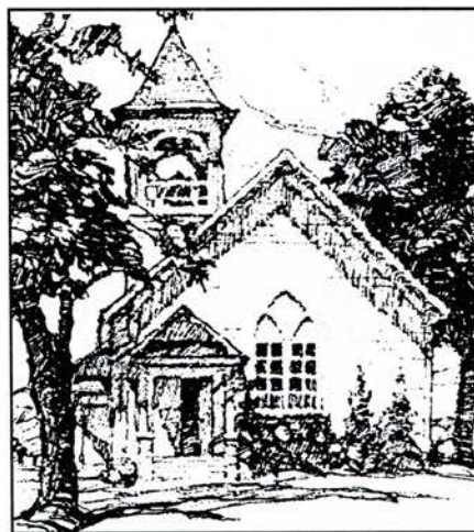
Alexander Valley Community Church