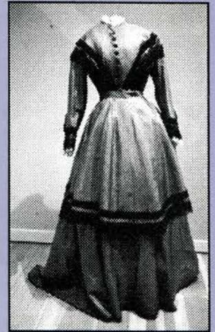
HMC # 338-74

There are eight buttonholes and six buttons. Buttons have metal bases covered and wrapped. Skirt has cartridge pleats at center back. Remainder of skirt is just on band with center front opening. The overskirt is apron shaped, longer in back than front, with rounded edges trimmed with the same pleated ribbon and lace as bodice. Overskirt is attached to waistband. Dress is lined in glazed cotton. (Description by Dawn Moser).