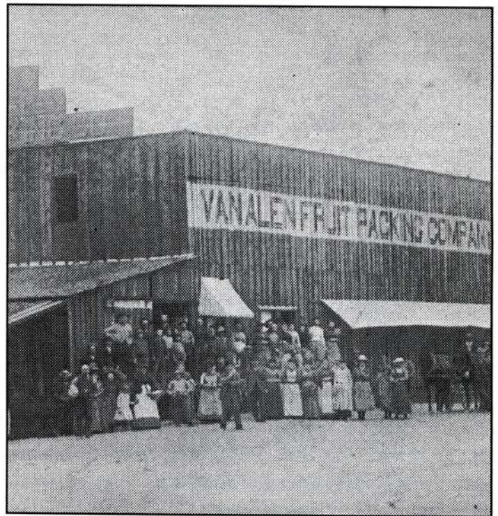
Van Allen Fruit Packing