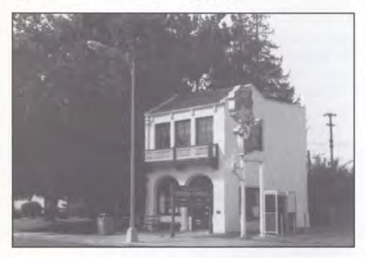
The Chamber of Commerce Building built by the WPA.

reservoir system; new buildings at the City electrical substation; a new system of City water mains and concrete culverts; a rebuilt Boy Scout clubhouse on Center Street; new sidewalks in downtown and residential districts; a new Healdsburg Elementary School building; a new high school playing field and auditorium; a Chamber of Commerce building; and an improved road from Healdsburg to the Geysers. (Clayborn, 1992). The federal government supplied labor wages and some materials for these projects.