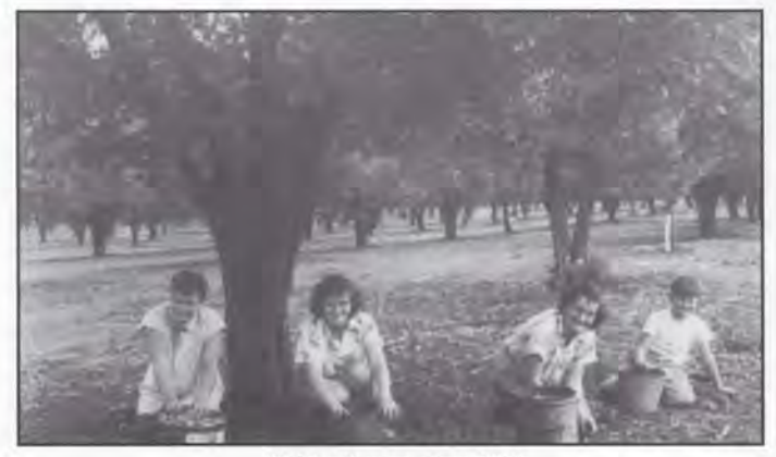
Picking Prunes, circa 1954

Until 1950 hops were one of the major cash crops in the area. From 1880 to 1950 Sonoma County produced about one third of the