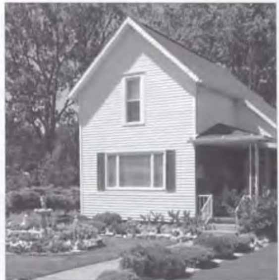
Esquivel family home

In conclusion, my dad had a very good childhood even though he didn't get everything that most kids might get when they were younger. This story shows that you don't need all those toys or fun birthday parties when you are younger. My dad had never told me anything from his childhood until this project, and I'm glad to have learned this. To this day, I can tell he tries very hard to make the best of his life for his sister and his family.