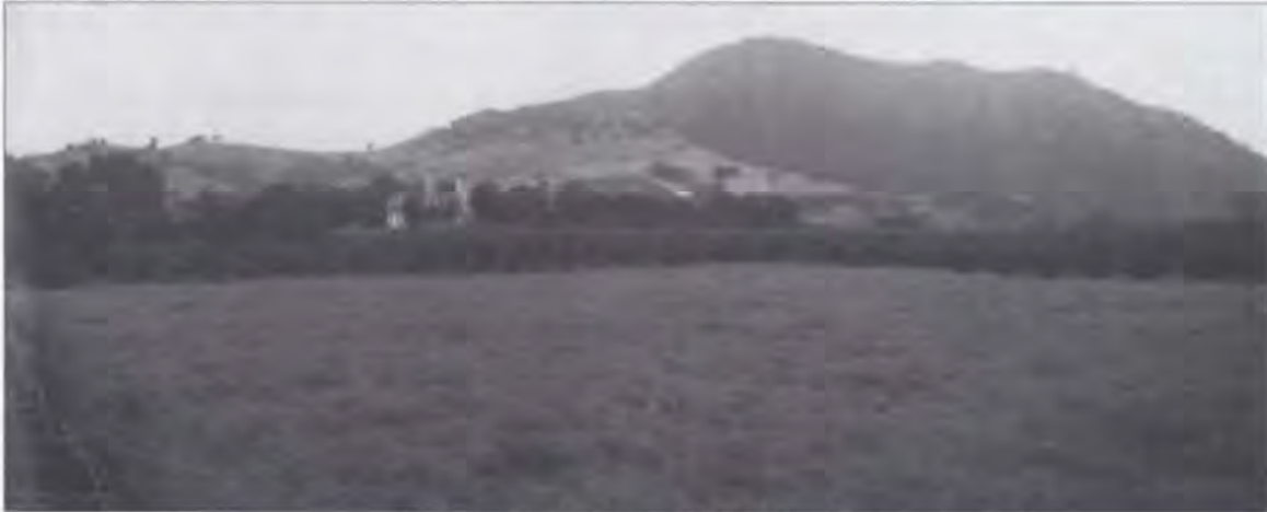
Sotoyome Rancho and Fitch Mountain

When California was incorporated into the United States, Santiago Arguello was very upset and he preferred to retire to his ranch in Tijuana, which was still part of Mexico. Captain Fitch, disappointed from all the arbitrary acts of the governments, went north where he had a number of properties in San Francisco and where he had claimed the Sotoyome Rancho, as his brother-in-law, General Mariano G. Vallejo, had proposed. [The Sotoyome Rancho included present-day Healdsburg in its 48,800 acre territory.] There, on the banks of the Russian River, he built what came to be known as Fitch Castle, a huge Victorian house that became the refuge of his soul.