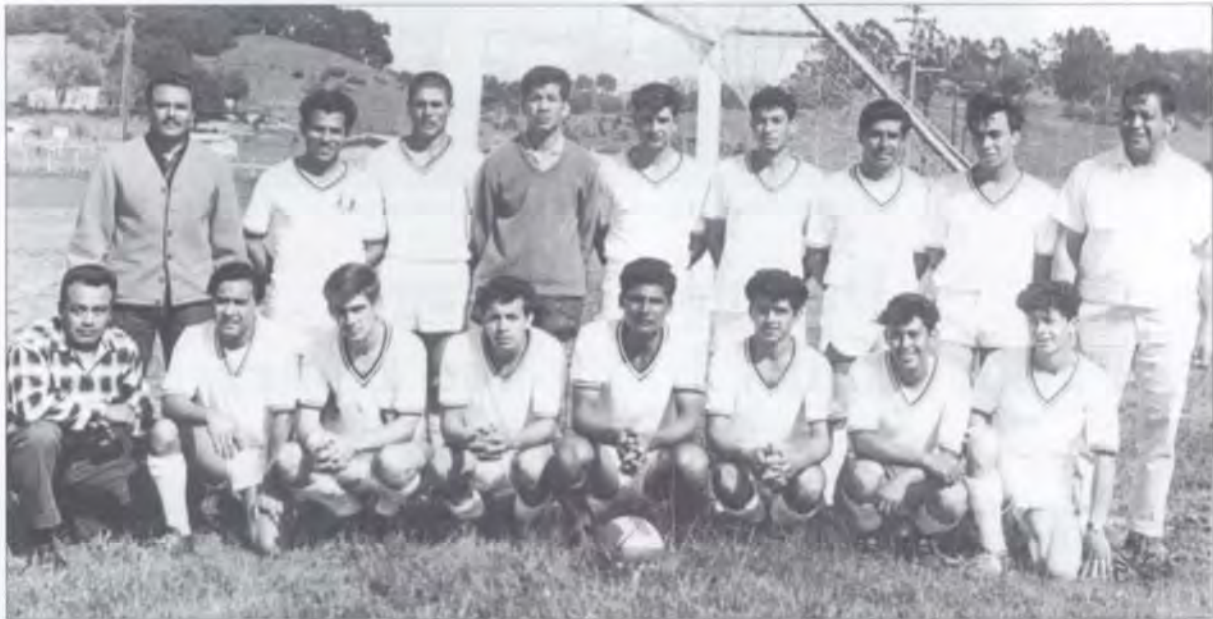
Healdsburg Soccer Club – April, 1965