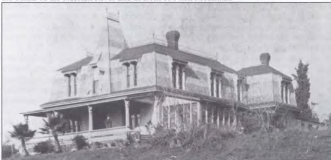
Fitch Castle at Sotoyome Rancho