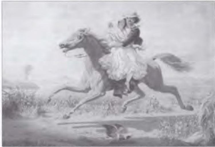
The Elopement, Pio Pico and Josefa on the way to meet Captain Fitch, painting by C. G. Nahl

Their escape caused the scandal of the age and even though everything was done in the most profound intimacy of the family, the rumors began to make their rounds. Some decided that the bride had been forcibly abducted. Don Joaquín swore to his family that if they returned, he would kill them for dishonoring the family name. He ordered that all her clothing and photographs be removed from the house and he prohibited the mention of her name.