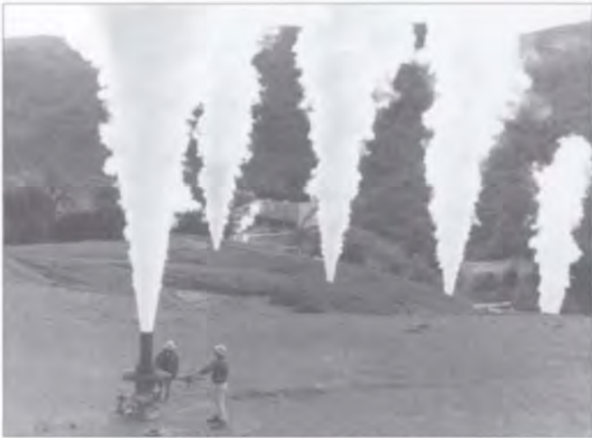
Men working on The Geysers

Redwood Highway, but it transports little redwood. Local sawmills (as well as most of the redwoods) have gone the way of The Geysers.