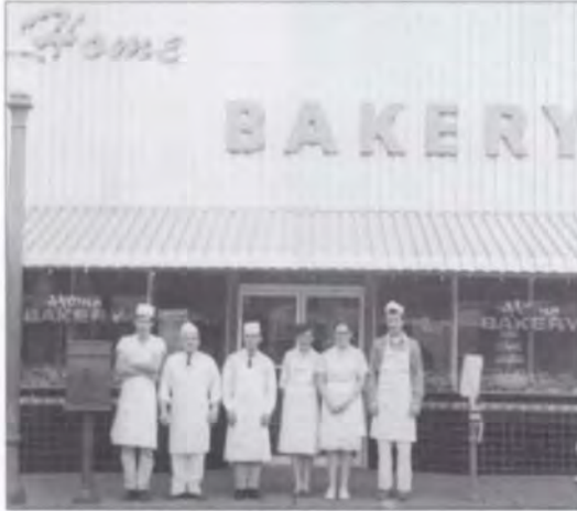
Home Bakery, 1964