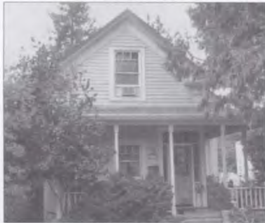
Our house on Tucker St.

My family moved to Healdsburg in the early summer of 1936 and rented a lovely little house on Tucker Street. After some squabbling, my brother (2 years older) got the upstairs back bedroom and I was pleased to move into the one upstairs facing front.