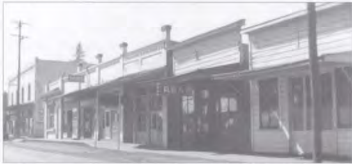
Main Street, Geyserville, looking south in May, 1938. The "Zan...." painted on the wall of the two-story I.O.O.F (Odd Fellows) building was identified from the ad in The Geysers 1938 yearbook as "Zanzi's, Plate Lunch, Fountain Service."

Next to and south of Lampson garage was Butterfield's Barber Shop. I only had my hair cut there a couple of times, because my father had always cut my hair.