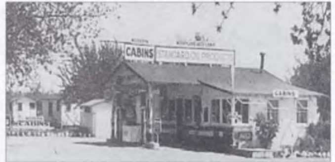
Merryland Auto Camp