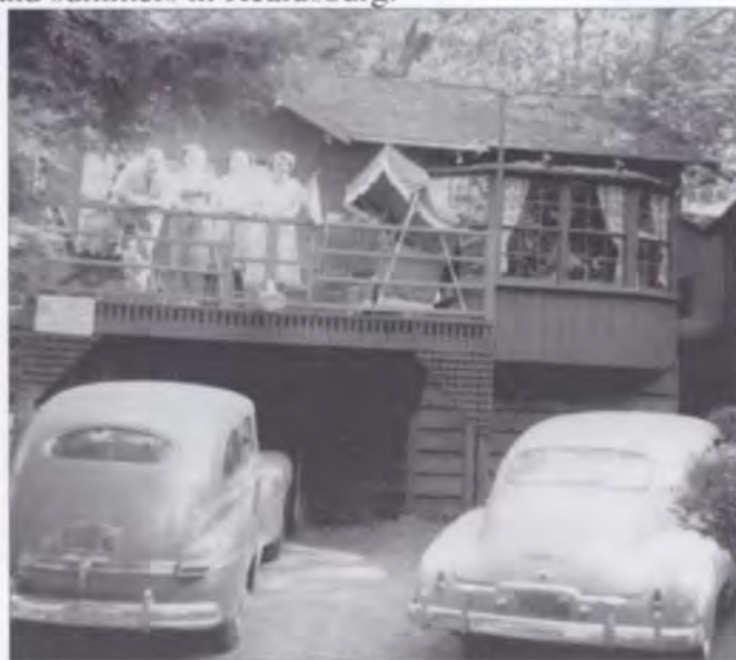
The Owl's Roost, 1950

Starting in 1946, our family spent every weekend and summer at the house in Healdsburg, which my parents named "The Owl's Roost." During the week in the summer, my father would go back to San Francisco to work, but my mother and sisters would stay behind in Healdsburg. All of us forged long, lasting friendships from our weekends and summers in Healdsburg.