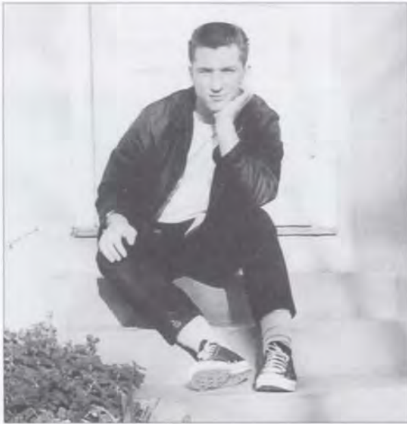
The author in 1960