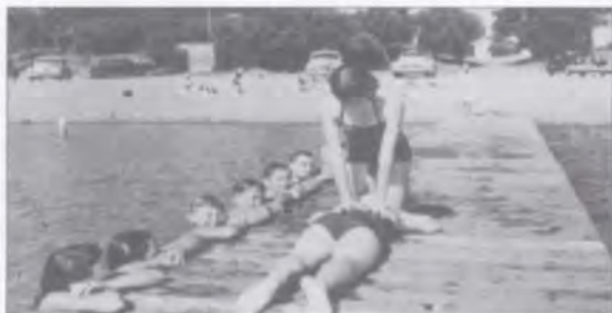
Swimming lessons at Memorial Beach, 1950s