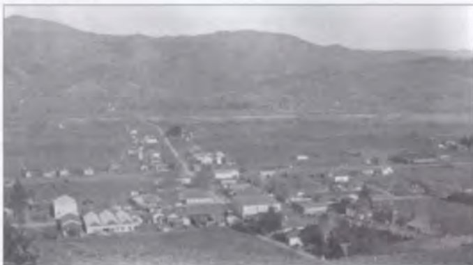
Aerial view of Geyserville

On September 2, 1945, America was celebrating VJ Day, the unconditional surrender of Japan, marking the official end of World War II. Two days later, I was born. With much less fanfare than was accorded VJ Day, I moved in with my Italian American family. We lived in the tiny community of Geyserville, a busy, if not sophisticated, full service village of about 1,500 folks. The town boasted grocery stores, gas stations, a bank, drug store, hardware store, branch library, schools, soda fountain, barber shops, car dealer and more. In the post-war boom of the 1950s, life in Geyserville was simple, yet fulfilling - a great place to grow up.