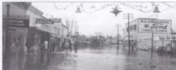
Flood of 1955 looking north on West St., Healdsburg (Alexander's Bakery is located where Costeaux is today.)