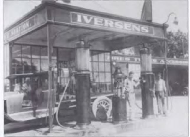
Iversens Service Station