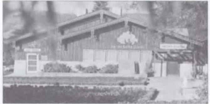
The Italian Swiss Colony Tasting Room, Asti

Redwood Highway, but it transports little redwood. Local sawmills (as well as most of the redwoods) have gone the way of The Geysers.