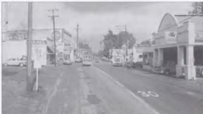
Geyserville Old Redwood Highway street scene, 1960s

I remember when Dry Creek went dry every summer. I assumed that's why they named it Dry Creek. We could taunt steelhead trout in winter and swim in Dry Creek during the spring, but by mid-summer, kids were limited to catching frogs and pollywogs in the few remaining warm-water pools. Ever since 1982 the creek flows cool and clear all summer long, the result of Dry Creek Dam and releases from Lake Sonoma. Today Dry Creek is never dry.