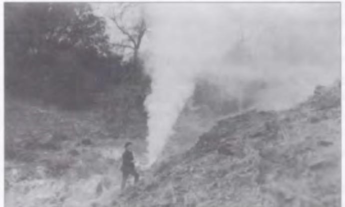
Exploring the Geysers, 1920s

upriver from the Geysers. And this flume was about a foot wide and high, and carried water all the way down there.