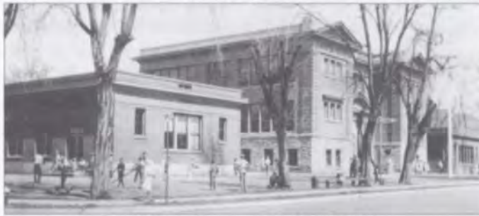
Healdsburg Grammar School, 1930s

The southern half of the block bounded by East, Tucker, Fitch and Matheson Streets has been the site of a schoolhouse since the mid-1800s. Some of that site is still being used for education by St. John's Catholic School today.