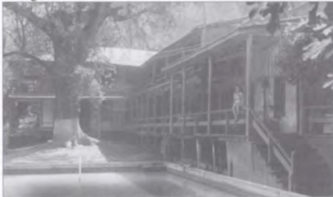
Geysers Hotel and Pool

Nowadays I don't think anyone younger than myself has much of a concept of the real old Geysers establishment. It was truly a world famous health resort. Their register would show kings of Belgium and a lot of other people came there for health reasons. The hotel itself was a great big old barn of a place, and I don't know how many rooms, maybe 18 or 20, even some of them suites. They had a fine dining room.