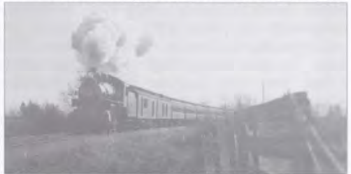
Train nearing Geyserville

I remember when wine tasting rooms were simply the cellars in many Italian homes. While many families grew some grapes and many made wine, premium wine grapes were not the major agricultural crop in the area. Prunes were the dominant crop, but there were no prune tasting rooms in cellars or anywhere else. Italian Swiss Colony at Asti was the only local winemaker that was nationally known, and they made what might be called "jug" wine. The premium wine boom of the 1970s made prune trees the firewood of choice. Today, in downtown Geyserville, classy wine tasting rooms are located in buildings that once housed a bank, soda fountain, grocery store and car dealership.