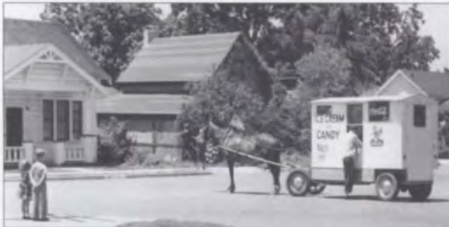
Mallon's Ice Cream Wagon