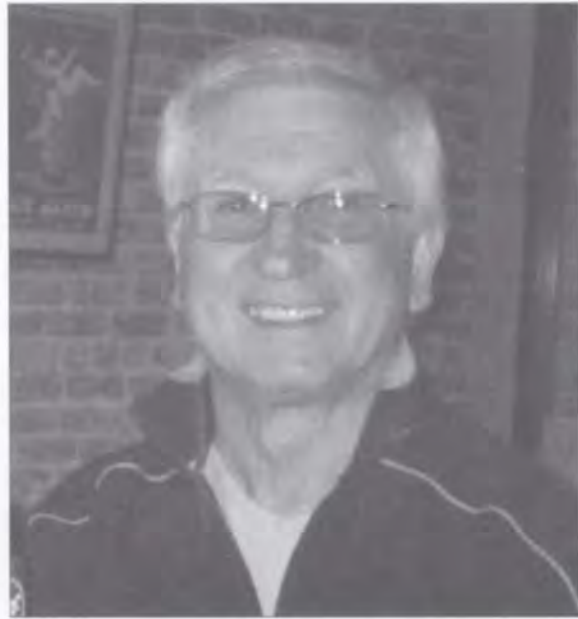
...and again in 2012