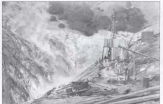
Mining at the Geysers

Everything came up through Healdsburg. The Cloverdale Road at that time beyond the Cloverdale Mine was not much of a road. And the Cloverdale Mine was in full operation then. It's located just about a mile above the mouth of Squaw Creek. It's still there, but it's long since dead. At that point in time there were three large quicksilver mines operating in the immediate area. One was the Socrates, which is considerably north and west of the Geysers. Then halfway up on the road from Healdsburg to the Geysers is a big canyon there, and that was the Culver-Baer Mine down in there. Then there was the Cloverdale Mine down on the Cloverdale Road. They thrived and did great things as long as the war or anything was going on. Mercury was at that point used for the big high explosives; and they got a hell of a price for it. But when the wars were over, their business went to nothing.