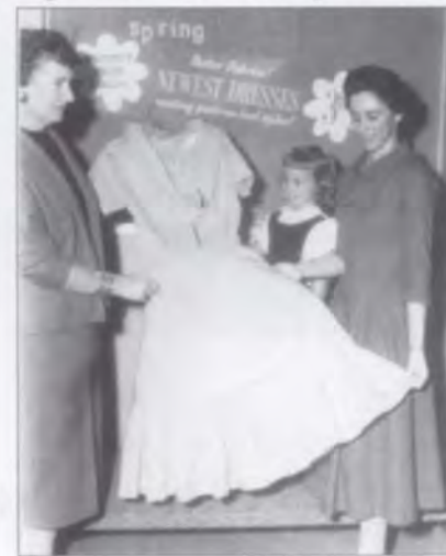
J.C. Penney, 1959