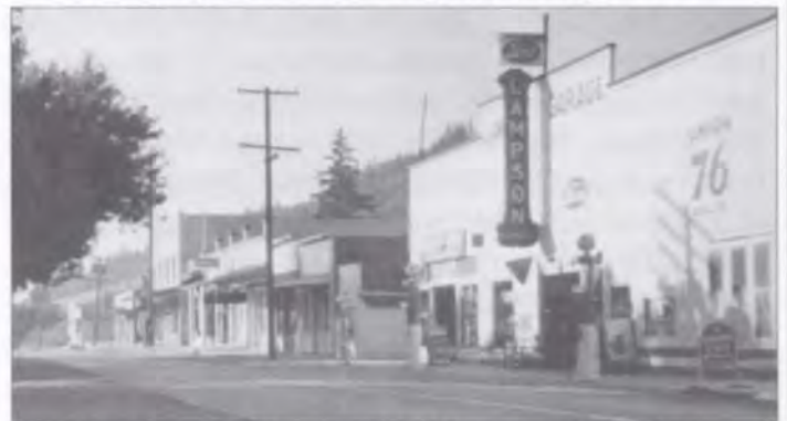
Street scene in Geyserville looking south about 1940