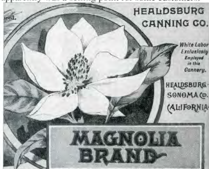
Magnolia muscat grapes label, note "white labor"