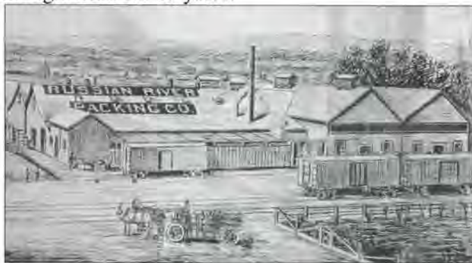
Sketch of Russian River Packing Co

Merchant sold his company to Healdsburg Canning Company in 1896. Longboard Cellars is located today where Magnolia Cannery (and later Healdsburg Canning Company and California Fruit Canners' Association) once stood. This venerable fruit packing plant was torn down in 1976 after sitting vacant for 20 years.