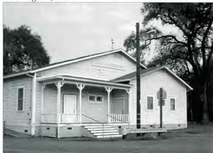
Geyserville Grange, 2013

There is some talk of reorganizing Healdsburg Grange. It is surprising that in a community so thrifty they should not have maintained their organization.