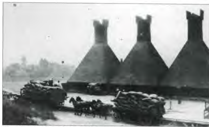
The Wohler Ranch hop kilns located across the road from the house were ultimately destroyed in a 1943 fire.