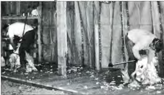
Sheep shearing 1975

BLB: I can tie wool, but I had to learn it. You have to learn how to tie it in a tight bundle and it's hard to do. [Tom's father] Pa could tie a nice tight fleece; he had to get it on the horse.