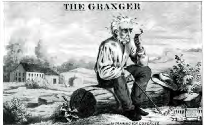
The Granger in Training for Congress, 1873