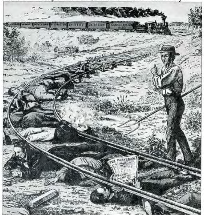
The Granger movement against high railroad prices

The Grangers promoted many progressive ideas, including opposing “fraud and adulteration in human foods.” At meetings in the late 1890s, they circulated Anti-Trust and Pure Food Law petitions, noting that they would be sent “to our Representatives in Congress, with the hopes of securing unadulterated food and protection from the various trusts of the land.” Grangers believed in equal taxation. They also launched initiatives to have agriculture taught in schools and colleges and obtained government funding for agricultural extension and demonstration work. They fought for, and eventually obtained, free rural mail delivery.