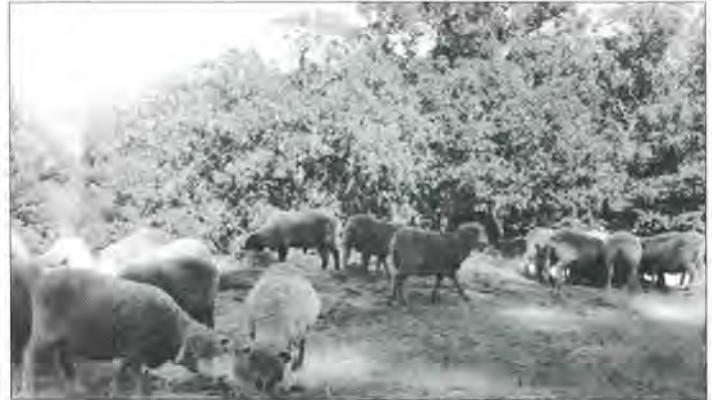
Feeding sheep north side Moffett, 1971

hold 'em a certain way, that's the key. First you set 'em up on their butt so you're behind them. You squeeze them with your legs. The machine (electric sheep shearer) is hanging up here over your head -- it's got a little gas engine and it's got a flexible shaft. To pull a sheep out of the pen, you grab one by the hind leg, tip it over, hold it there and start to take the belly off. The wool buyers don't really like the belly wool, because it's usually full of stickers. The best wool is all over the back. You'd shear once a year. More than that isn't good for the wool clip. They want a certain amount of length at the mill. If you shear them twice, you don't get that length for the fibers.