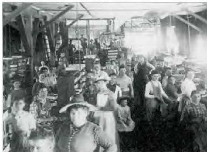
Interior of Magnolia Cannery, 1890

The Van Alen Packing Company was established in 1887 by William Van Alen. Its main building was located on the railroad tracks to the south of Healdsburg Avenue and Mill Street, approximately where NuForest Products is today. Specializing in fresh fruit, a labor force of approximately 250 worked 10-hour days during the season. Workers packed 5,000 cases (or 15,000 cans per day) of fruit the first year. Two hundred women and girls made up the majority of the work force with only 40 men and boys. There were 10 Chinese men employed, who labored in a separate area from the women and girls. Between 20,000 and 25,000 cases of fruit were packed at the Van Alen cannery in 1891, of which about 75% were peaches. About 3,000 cases of cherries, 1,500 of pears, 2,500 of plums, 4,000 of apricots and 200 cases of berries were processed. A large drier was erected near the cannery in 1891 and approximately 35 tons of prunes were dried that first season. In the 1890s, the company spent $25,000 on fruit in a single year.