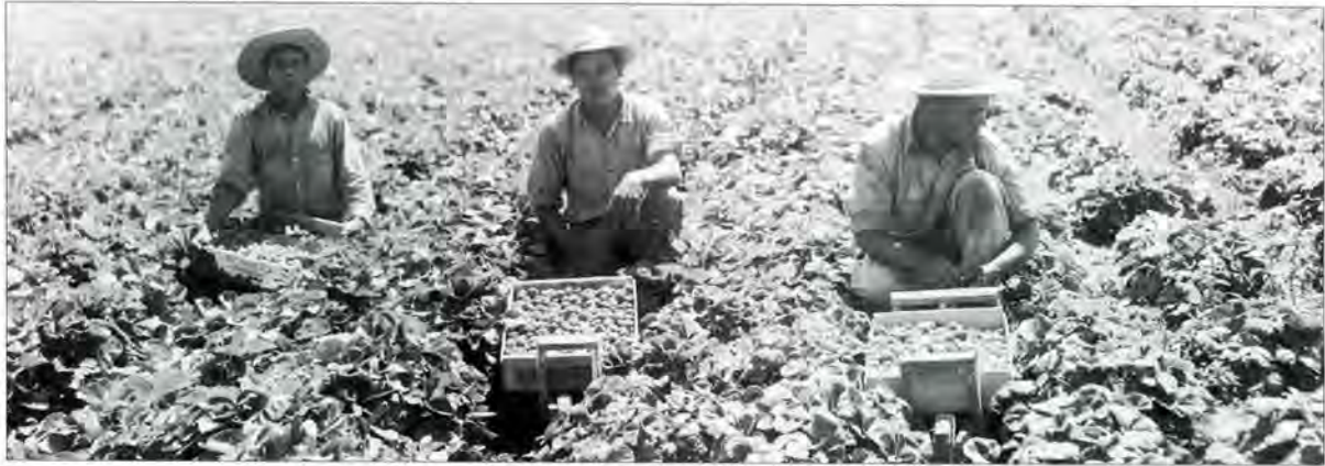
Braceros at work on Healdsburg farm, 1940s