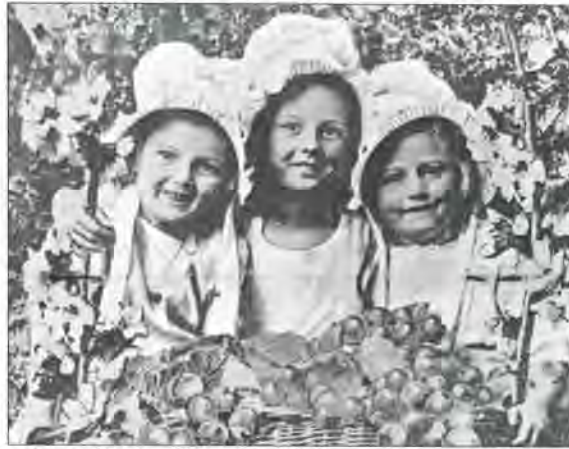
Promotional art from 1910s - "The Healdsburg Triplets - Prunes, Grapes, Hops"