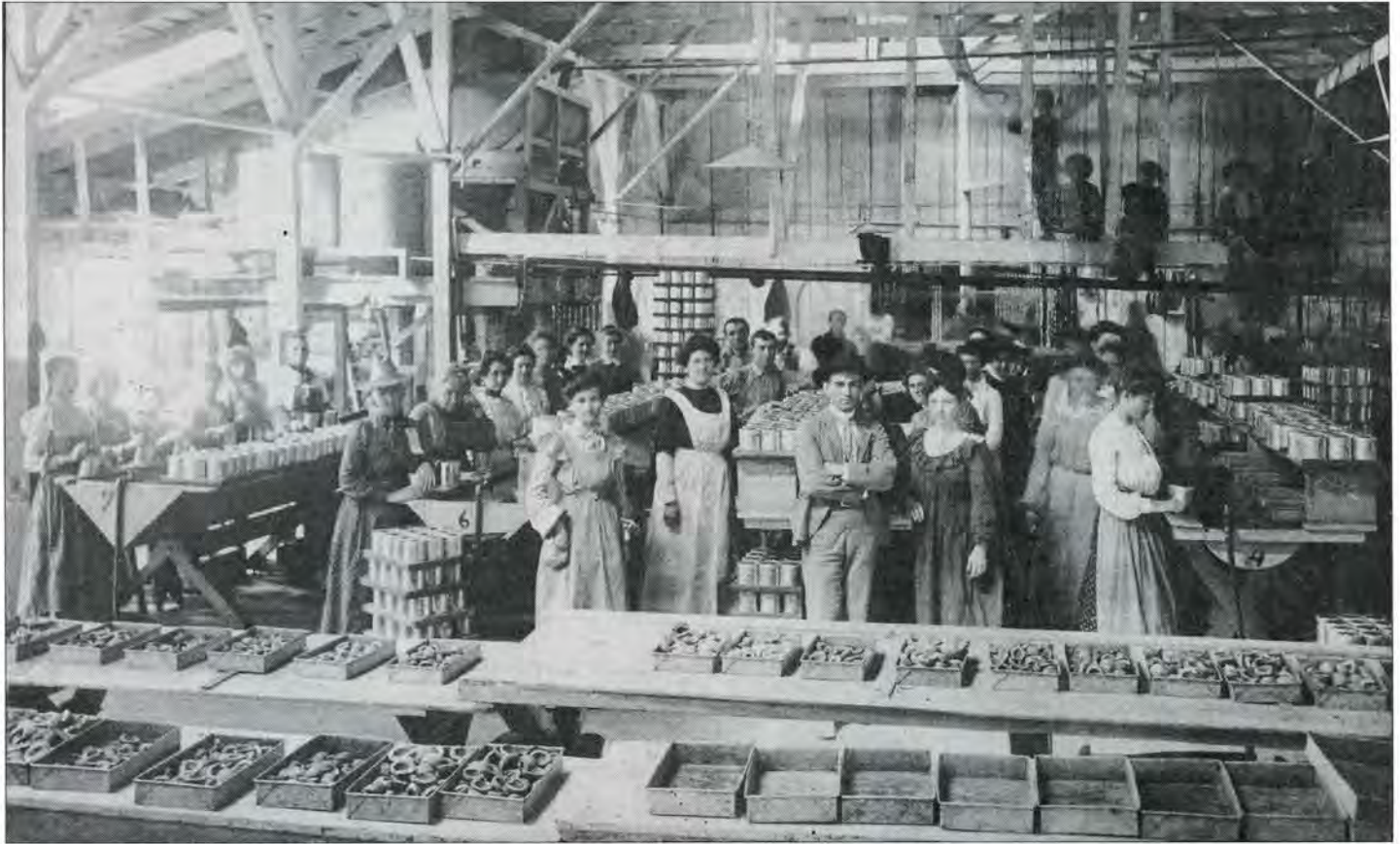
Cannery "operatives," c. 1910