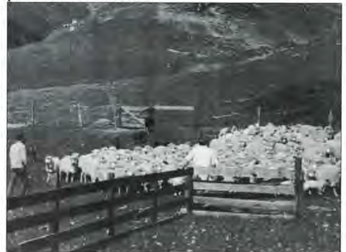
Tom working the sheep with dogs, 1974

BLB: We bought rams wherever we could get them. The rams are very important to the wool you'd get and also for your market lambs. When I first came here to the ranch, Tom's father had all Merino rams and then later we used black-faced rams to produce market lambs.