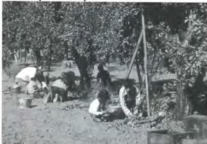
Harvesting prunes off the ground, 1957

Determining when harvest would begin was decided by the farmer, not the buyer as in today's more common practice of grape picking being decided by the winery.