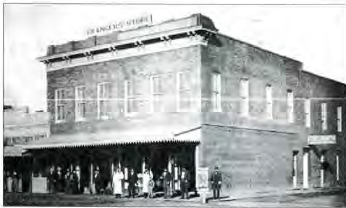
Healdsburg Grange, c. 1875