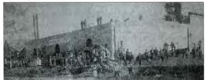
Magnolia Cannery and workers, 1892

The arrival of the San Francisco and North Pacific railroad in 1871 put Healdsburg on the map and facilitated the distribution of its produce across the country. In the 1870s, farmers in Sonoma County, appreciating the fertility of their soil and climate, began to look beyond the familiar grain crops that they had brought from the Midwest. Wheat, oats, barley, alfalfa and corn were still planted, of course, but in the Healdsburg and northern Sonoma County region, many farmers began planting orchards and cultivating berries. The marvelous productivity of these crops exceeded expectations and soon made canning practically a necessity to avoid wasting the excess produce. Yet production of fruit was one thing; successful packaging, marketing and distribution of it was quite another. The 1880s saw the rise of canneries.