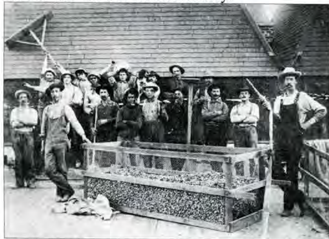
Hop drying time on the Wohler Ranch finds this hearty bunch of Italian immigrants mixed in with some of the locals.

Old photos show some of these new immigrants settling in tents in a grove of trees; while others settled into cabins and houses scattered around the ranch. Those who were fortunate to live year-round on the ranch were put to work taking care of other crops, such as alfalfa, hay, potatoes, grapes and apples. They began to plant vegetables, onions and garlic around their little houses for their own tables. They had to live in a very frugal manner, but were used to that "back in the old country."