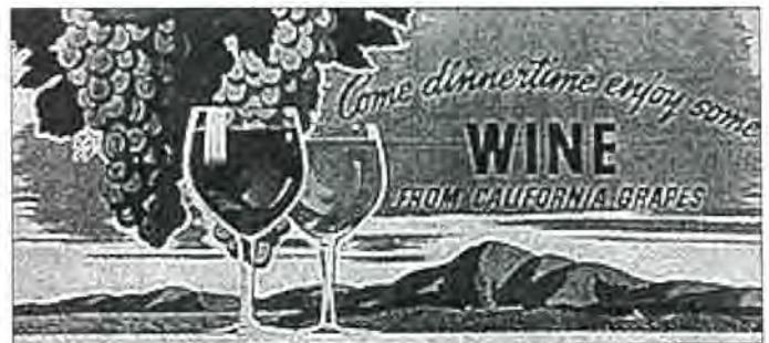
A generic ad for California Wine

The wine advisory board was instituted in 1939 and there took form an advertising campaign of three year's duration at a cost of two million dollars to be financed through a state marketing assessment of \frac{3}{4} cents per gallon on all dry wine sales and 1 \frac{1}{2} cent per gallon on all sales of sweet wines. Immediately upon the invocation of this program sales were increased and gains have been small but continuous month by month. Education, through the program, of the American public to the use of wholesome wines at meal time and sweet wines for appetizers and after meal drinks will bring consumption in America to many times its present level. We must not however lose sight of the fact that only better wines will win public appeal and demand, and any vintner who deviates from this thought and sacrifices quality for volume will be a monkey wrench in the wheels of progress. The public should also cooperate in maintaining this advance toward better wines by insisting that the goods be from the location which the better wines are made. To be frank and explicit – dry wines from the north and sweet wines from the south of the state.