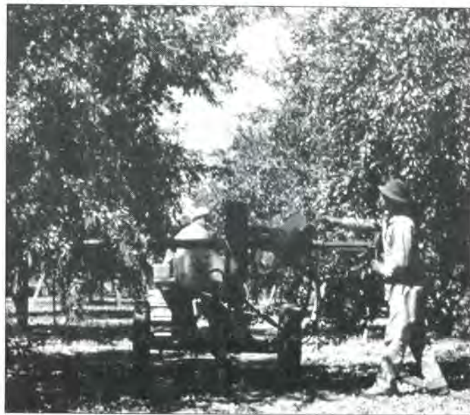
Working the shaker machine, 1962

Imperial prunes were easier to pick since they are larger and it took fewer to fill a box. First, we would put the prunes into a metal bucket and then dump the full bucket into a box. A box measured 24" x 15" x 8.5" and weighed about 40 to 50 pounds when it was full. Each box was marked in chalk with our assigned number. We were paid 25 cents per box.