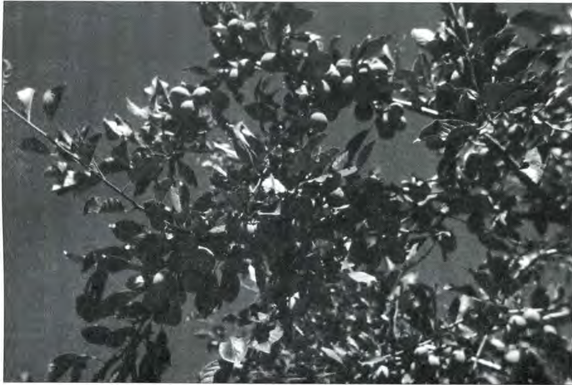
Prune Tree, 1957