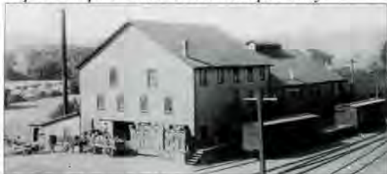
Porter Brothers Cannery, 1890s

packing house. They will pack for the association in the buildings of the old Russian River Canning Company, which will be adapted to the purpose. They expect to pack two carloads per day.