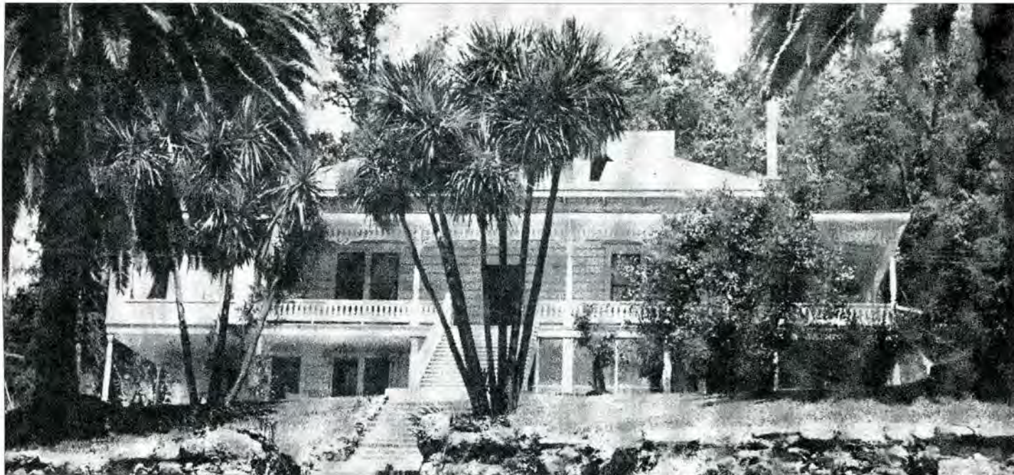
The "big white house on the hill" was a focal point of the Wohler Ranch.