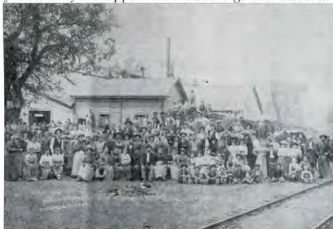
Cannery operatives outside of Van Alen Co, 1890s

At Healdsburg and vicinity there are about 12,000 acres in peaches, about 10,000 acres in prunes and about 800 acres in other varieties, such as apples, cherries and apricots. The industry has taken good foothold and three large canneries, the Magnolia, Van Alen and Russian River canneries are established here. These companies employ from 1,000 to 1,200 people, and a great many families come from Mendocino and Lake Counties to camp near these factories to get employment during the season. A large quantity of fruit from other sections of the county is shipped to Healdsburg to be canned.