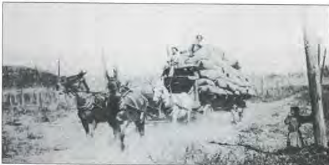
Raising dust on a hot summer day, four mules pull a load of bulging hop sacks to the Wohler Ranch kilns.

Immigration period as opposed to the First Immigration of English, German, and Swedish people.