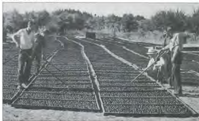
Men tending to prunes drying on trays.

Our ranch had been in prune production since the 1920s and had used the sun-drying method until about 1955. Many in the valley continued sun-drying well into the 1950s. Eventually most ranchers built their own dehydrators or hauled fresh fruit to a commercial dryer such as Sunsweet. Sunsweet was one of several commercial dryers in Sonoma County which processed prunes. (The old Sunsweet dryer is now Sun Industries storage facility.) Metal rails in the concrete are remnants of the tracks in the dehydrator tunnels that were used from the late 1950s to the late 1970s.