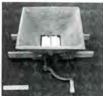
Grape hand crusher (HM&HS artifact)

I well recall the old hand crusher, which was an improvement over even cruder methods of days before, consisting of two grooved cylinders revolving in opposite direction within a hopper into which the clusters were dumped as they came in from the vineyard.