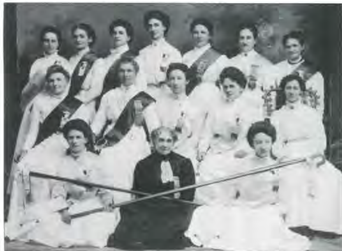
Women of Healdsburg Grange, c. 1900

for each Patron appears to have a "little farm well tilled and a little wife well willed."