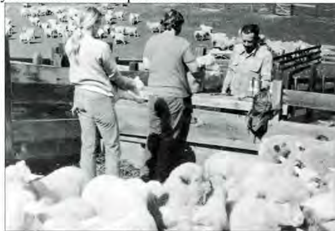
Marking lambs 1974

Shear around the butt. Clean around their eyes so they can see. A wooly sheep is pretty wooly everywhere. On this part of the ranch there were four fenced pastures: the south side, the north side, the east Moffet and the Sentiny. They each had gates and you could close the pastures off.