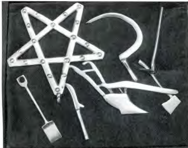
Ceremonial symbols of the Grange - Healdsburg Museum

mutual instruction and protection, to lighten labor by diffusing a knowledge of its aims and purposes, expand the mind by tracing the beautiful laws the Great Creator has established in the Universe, and to enlarge our views of Creative wisdom and power.