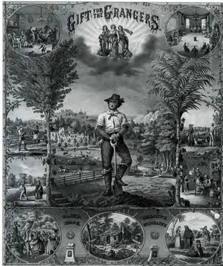
Gift for the Grangers, 1873