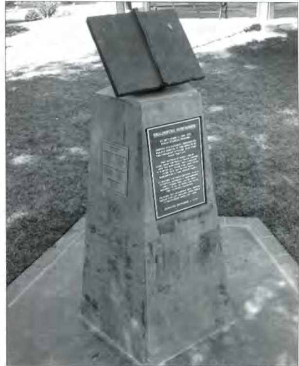
9/11 monument in Plaza, 2014