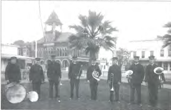
Sotoyome Band in the Plaza, 1910