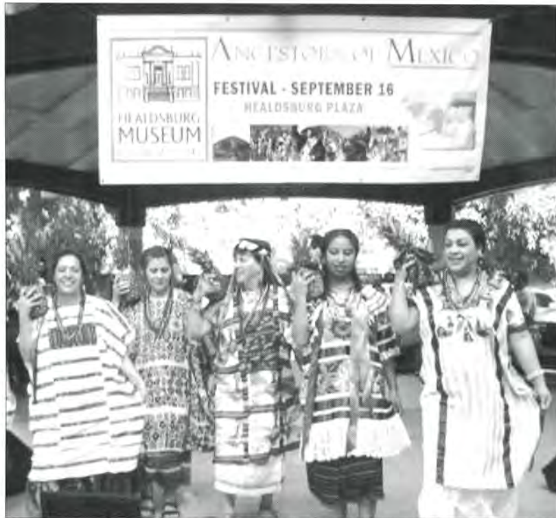
Ancestors of Mexico Festival, 2012