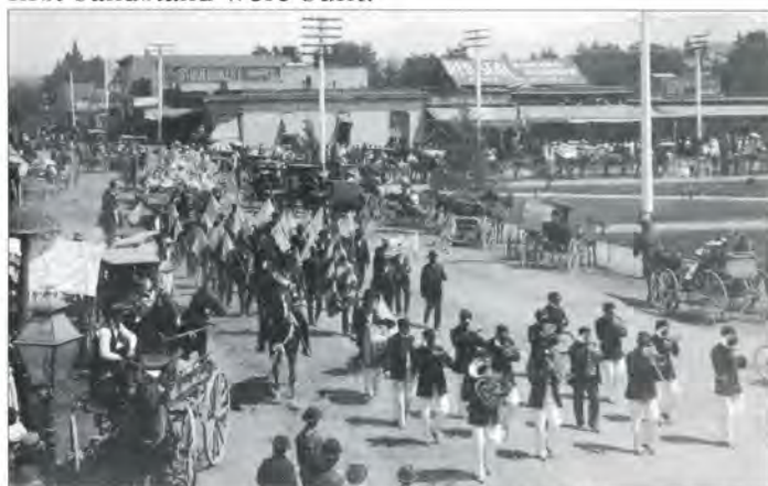
Sotoyome Band, 1899

In 1873, the native trees were cleared from the Plaza and pines, fir and eucalyptus were planted. (This was just the first of the various Plaza landscaping projects over the years, but that's another story.) About five years later the bell tower and the first bandstand were built.