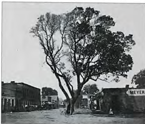
Madrone tree in road at corner of (what is today) Healdsburg Avenue and Plaza Street, 1869

Pioneer stories are always interesting. They are of discovery and take the reader back into an unknown land as it came from the hand of creation. Harmon Heald was a pilgrim with a vision reaching far into the years ahead of him, so he came with his ox teams and lumbering wagons into the meadow and the beauty land of the north. He explored and rode as a vaquero over all of the Sotoyome land, and in 1851 he pitched his tent beneath a big Madrone tree which stood in the center of what is now [Healdsburg Avenue] at the corner of [Plaza Street].