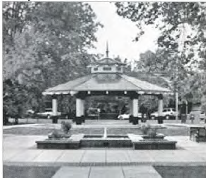
Plaza gazebo, dedicated 2007