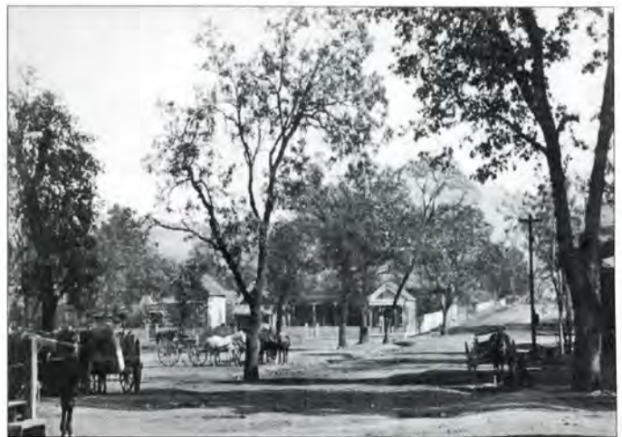
The Healdsburg Plaza before it was fenced, and with a few remaining native trees in 1872. Wagons used the Plaza as a parking lot. In center, view is east on Matheson St. from Healdsburg Ave.

The town, as Heald laid it out in 1857, was in the common "grid" pattern pervasive throughout the West. But the focus of its streets on a plaza/park was somewhat unusual for northern California. He was no doubt influenced by the old Mexican military parade ground/plaza in the nearby town of Sonoma. The name itself betrayed its Mexican origins, for it was never called a "square" or "commons" as such places were known in New England, but was always referred to as the "Plaza" from 1857 on.