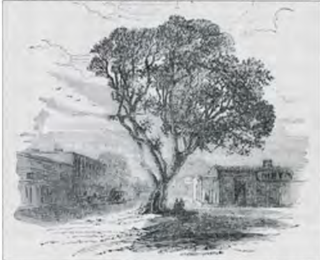
Source: Beyond the Mississippi Madrona Tree, Healdsburg, California, 1859

Although it is difficult to identify all of the native species of trees that once shaded the Plaza and town site, photographs from 1864 to 1873 suggest that it was covered with Pacific Madrone, Black Oak, Valley Oak, Coast Live Oak, and Black Walnut. The Indians may have transplanted the Walnut to their village sites.