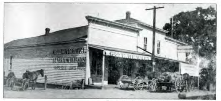
Remmel General Merchandise Store

The men enjoyed playing bocce ball, a game played on a long narrow court with wooden balls. Most of the Italian farms had a court for their favorite entertainment. As the men played and women visited, children grew noisy and hungry, consuming loaves of home-baked bread and homemade jelly. Some visitors would linger long enough to be invited to the evening meal, knowing the women were prepared to feed them all.