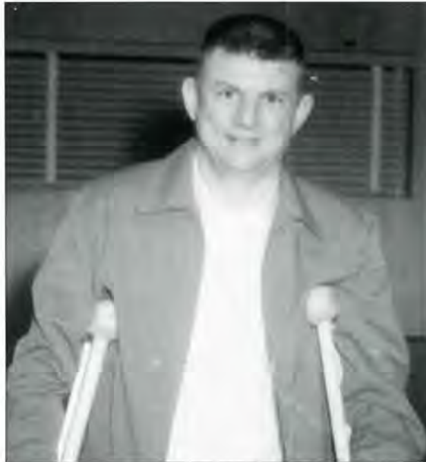
February 1962.