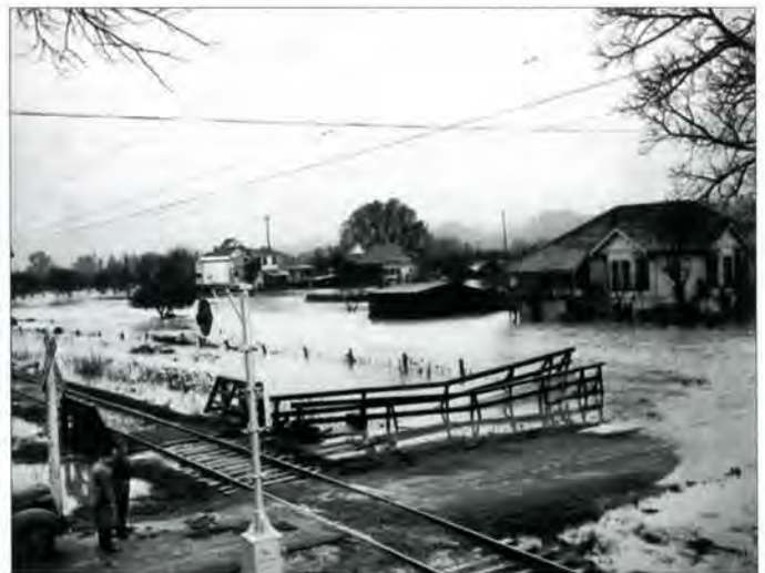
Healdsburg flood, 1937.