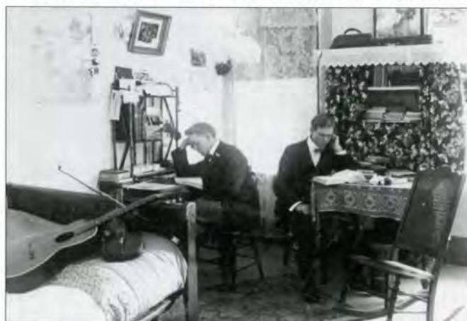
Student dormitory room, 1900.