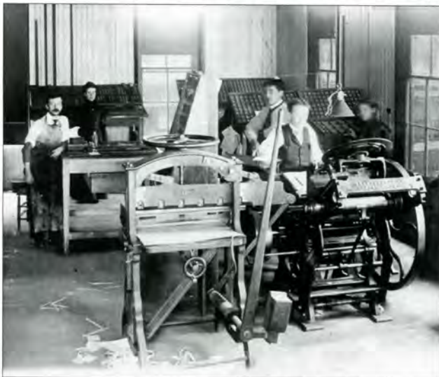
Printing press at Healdsburg College, 1900.