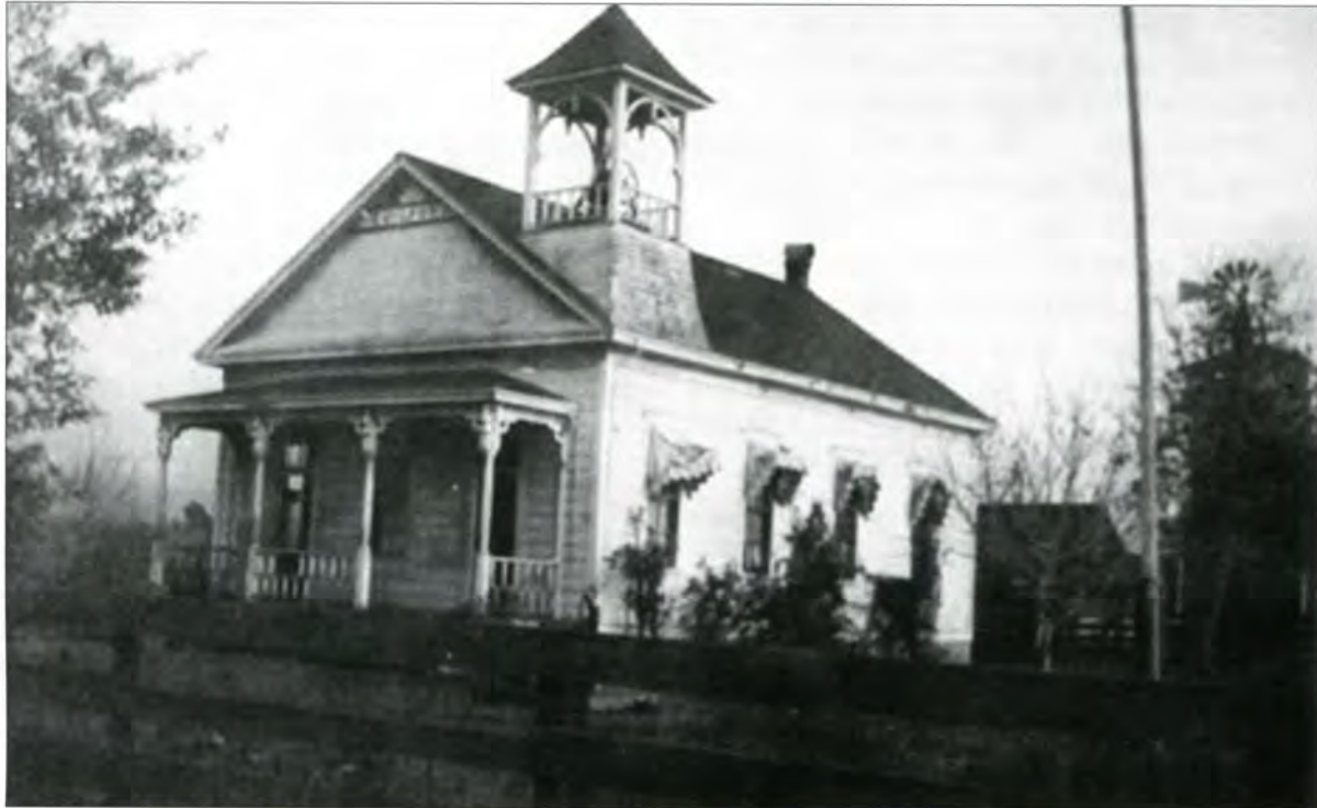
Source: "A Proposed Reorganization of the School System of Sonoma County" by William Baker, 1916 Guilford School, before 1916