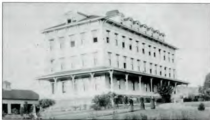
"North Hall" Healdsburg College Dormitory, 1900