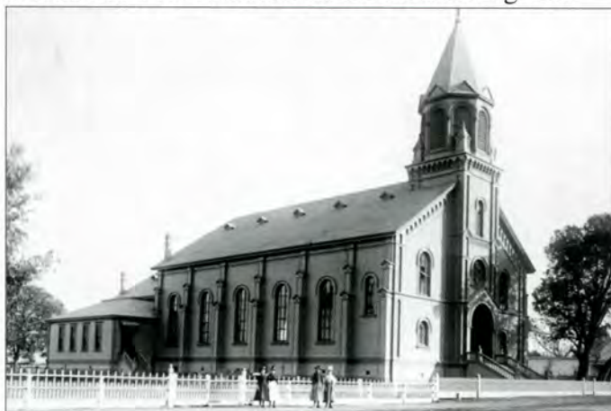
Seventh-day Adventist Church on Fitch Street, 1880s.

members. It provided for the church needs of the students and the members of the Healdsburg area.