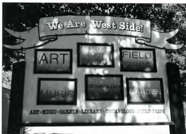
West Side School kiosk, 2016