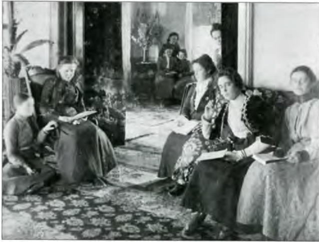
Student lounge, North Hall, 1900.