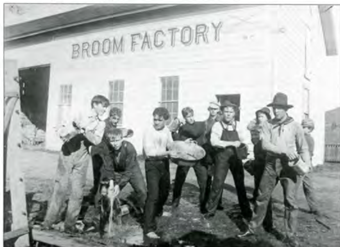
Water fight at the Healdsburg College Broom Factory, 1900