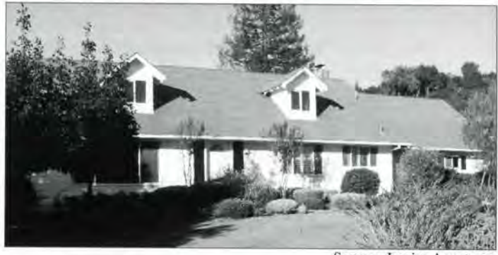
A sampling of Colombano Custom Homes - 235 Sherman Street., 624 Bianca Lane., 1440 Prentice Drive., 609 Coghlan Road