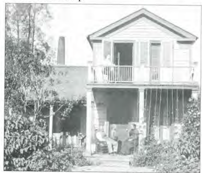
Lindsay Carson residence at 641 Healdsburg Avenue, c. 1895

Doors have the same proportions as windows, both being long and narrow. Windows are composed of many small panes (usually six-over-six) with simple architraves at the top.