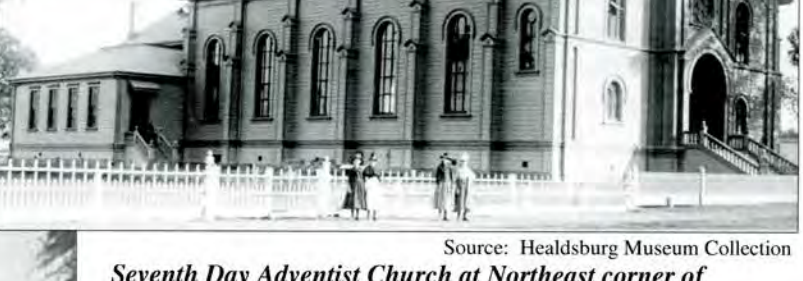
Seventh Day Adventist Church at Northeast corner of Fitch and Matheson Streets, built in 1887