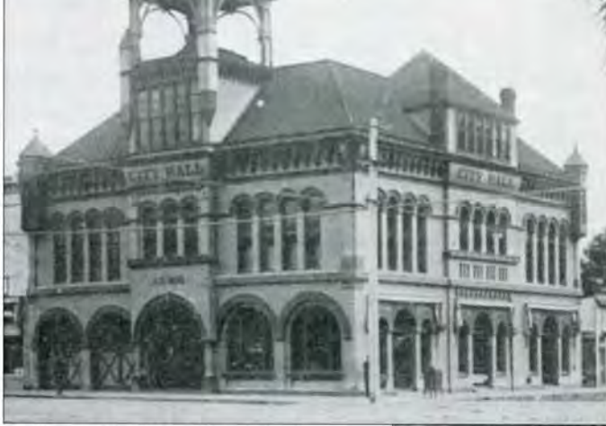
Healdsburg City Hall at Southeast corner of Center and Matheson Streets, built in 1884