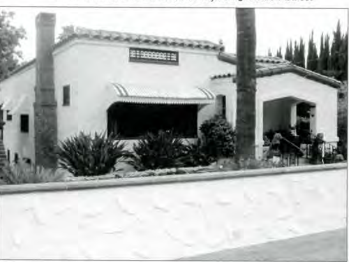
2002 Winner - Norma Cousins, 403 Powell Avenue