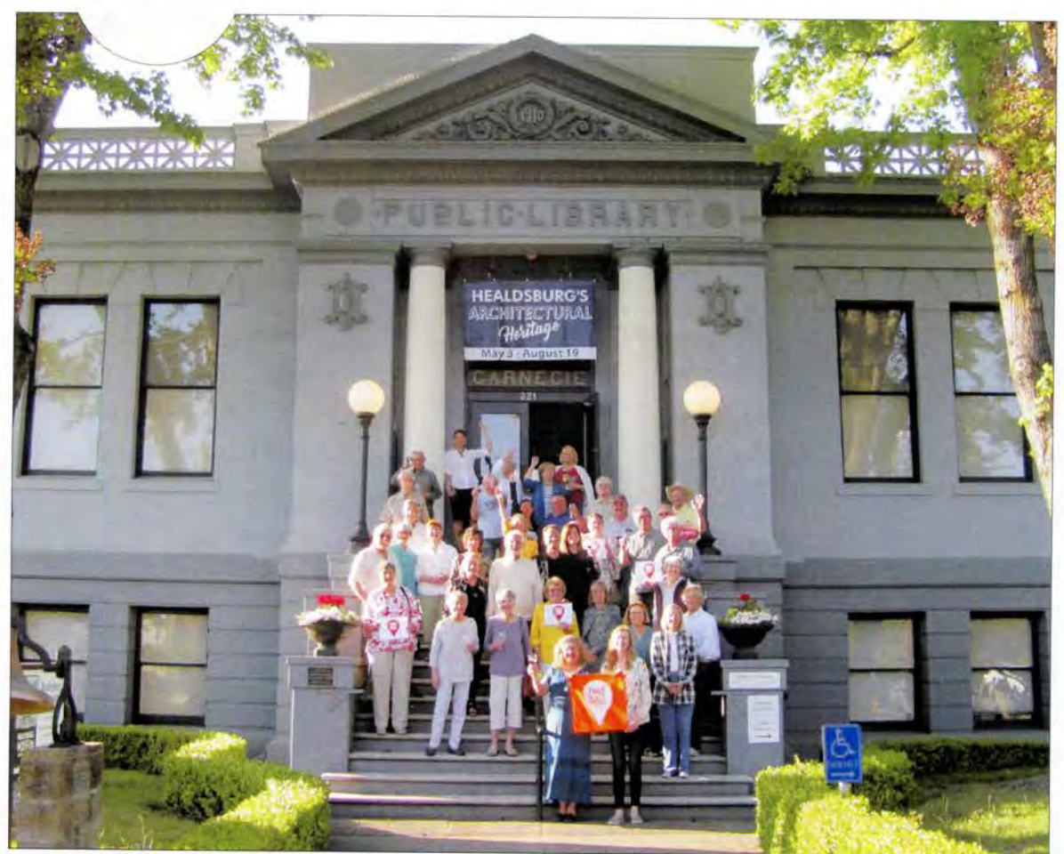
Source: Healdsburg Museum Collection Carnegie Library/Healdsburg Museum "This Place Matters," May 2018