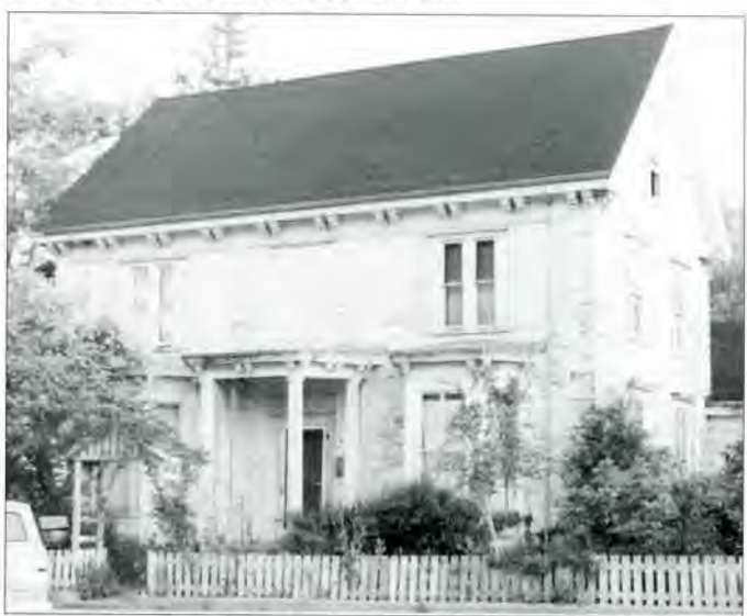
Marshall House in a continued state of disrepair, 1978.

Mark and Phillip installed a foundation and replaced the roof, installed wiring, plumbing, heating and cooling systems, interior walls, floors and lighting. They repaired or replaced rotted woodwork, windows and doors.