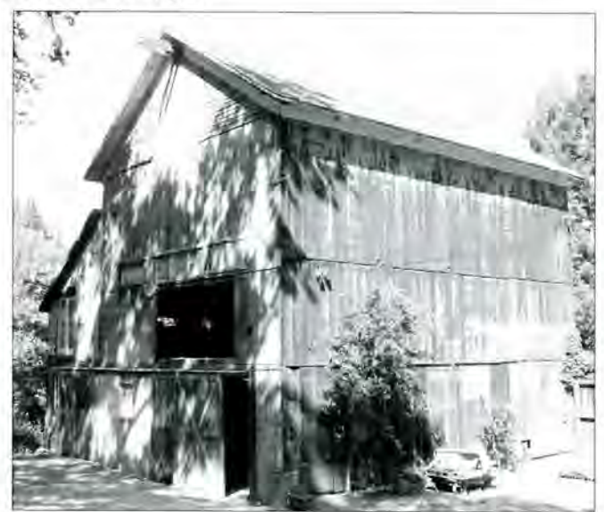
March and Heald mill, built 1850

The first thing we did was to go into the woods or timber and cut logs of proper length for the sides and ends of the cabin or house, also poles for the ribs to lay the shakes on for the roof, and to weigh shakes down to keep them in place. Then I we would] select a white oak tree to make the shakes from. [We would] have the logs, shakes and all on the ground where the cabin is to be erected. Then the neighbors are asked to a "raising" to carry the corners of the cabin. The first logs are laid at the ends of the cabin, a saddle is made on the top of the log, and now it is ready for the side logs which are notched to fit the saddle, and so on until the cabin has been raised to the desired height. Then gable logs and ribs are pinned on by boring auger holes and driving wooden pins in them to hold them on. Then the shakes come next. They are laid and the weight poles are put on top to hold the roof on. The floor is made of puncheons split out, hewed, laid on top of floor joists. The chimney and fireplace are made of clay jams and the flue is made of sticks and plastered with clay mortar. The four corners of the flue are weighted down with four balls of stiff clay mortar. The doors are made of puncheons and hung on wooden hinges.