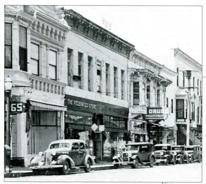
West Street (Healdsburg Avenue) looking North from Matheson Street, c.1935