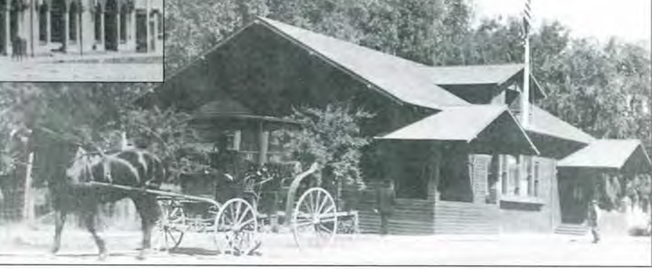
Women's Improvement Club at Center and Piper Streets, built in 1913, demolished in 1956 to make way for the Mitchell Shopping Center