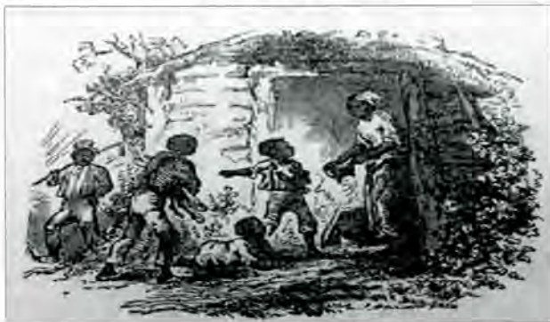
Source: Uncle Tom's Cabin , first edition, 1851

sympathetic account of heroic African American slaves and an evil master in the South. Ironically, this child who was named after a white author, still could not enter a white public school to learn to read 20 years after the book had been written!